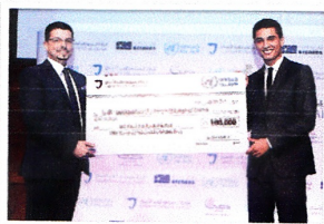
United Nations Relief and works Agency for Palestine refugees - UNRWA