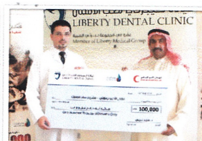
Emirated Red Crescent Water Aid Campaign

Liberty Dental Clinic is a socially responsible organisation that is fully committed towards supporting all the various sectors of the society in the UAE or abroad.