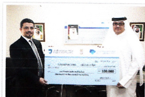
Dubai Autism Center