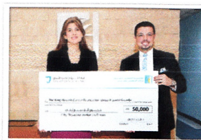
New Expansion of King Hussein Cancer Center