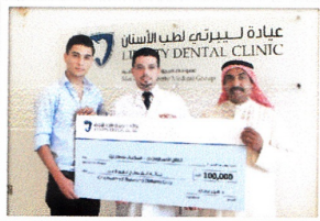
Emirates Red Crescent Aid Convoy to Gaza