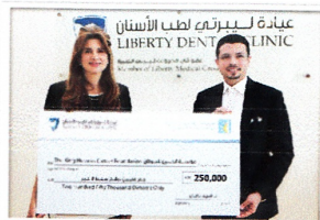
King Hussein Cancer Foundation