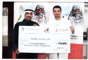
Emirates Red Crescent