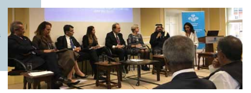
Leaders & Laureates at Prince's Trust International Leadership Programme in Windsor, England

IRI speaks at the CSR for All in Turkey leadership of TISK in cooperation with the International Organization of Employers (IOE)