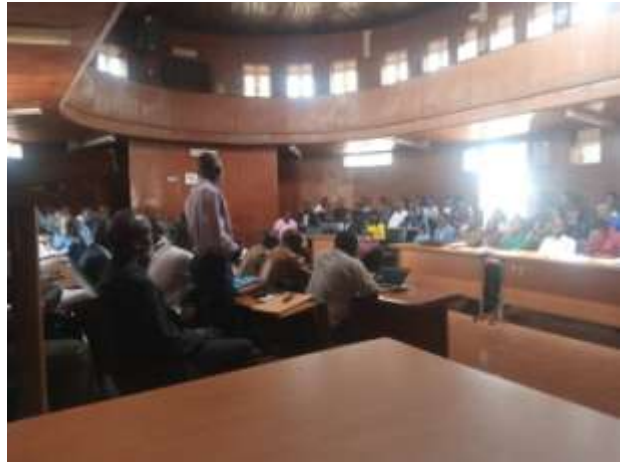
Father and Child Dialogue in session at Council Chambers - Kyenjojo