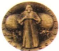
Comenius Medal, UNESCO, Paris, 1998 for innovative work in literacy