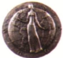
King Sejong Literacy Prize, UNESCO, Paris, 2002