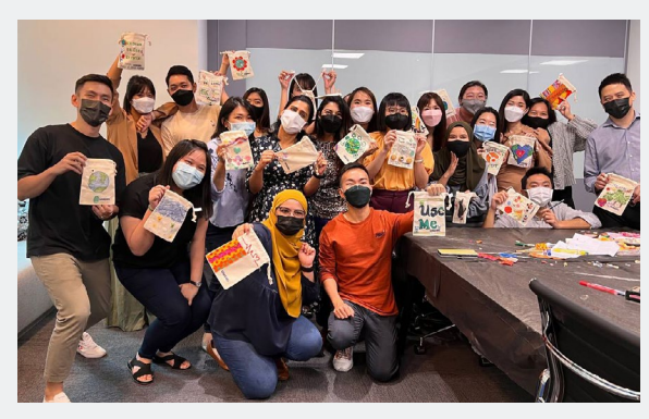
The Singapore team created reusable drawstring pouches for those in need.