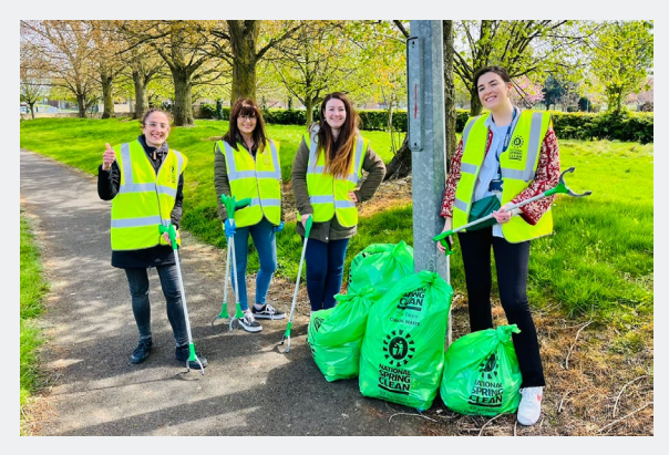
The Ireland team participated in a park clean up near our Dublin office.

Each of our 11 offices across eight countries participated in Earth Day events in 2022. Employees helped preserve the environment and give back to local communities.