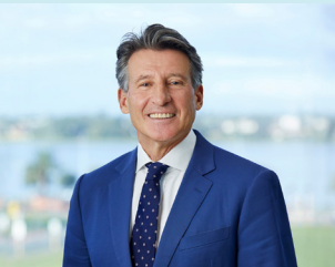
Lord Sebastian Coe CH, KBE Non-Executive Director