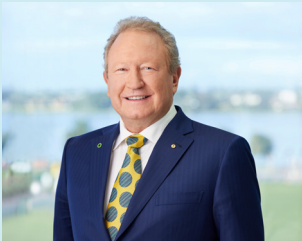
Dr Andrew Forrest AO Executive Chairman

Fortescue has a talented and diverse Board committed to enhancing and protecting the interests of shareholders and other stakeholders and fulfilling a strong governance role