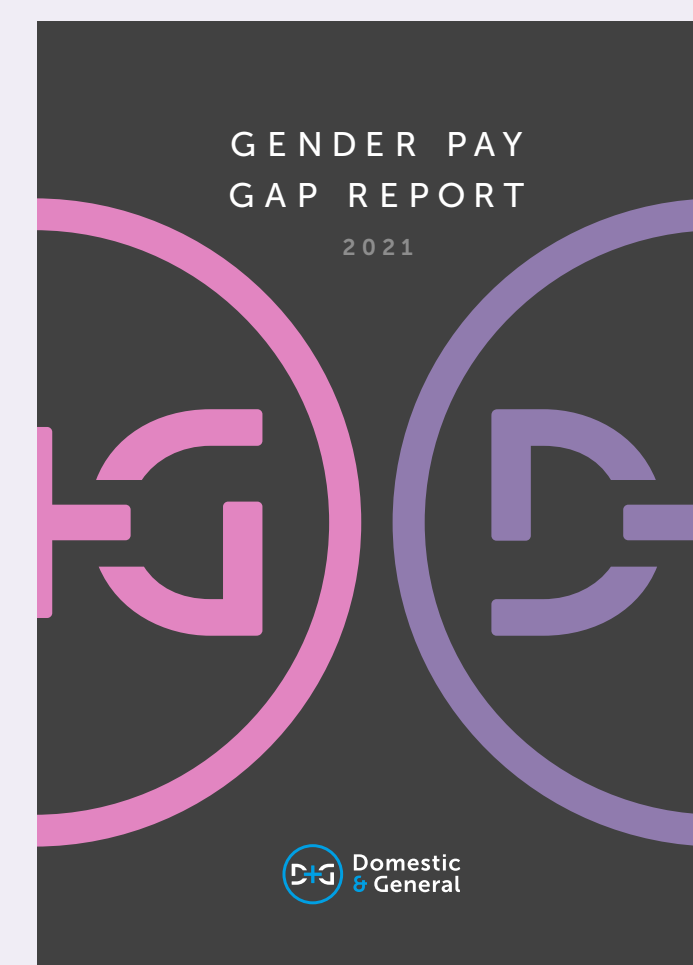
Gender pay gap report 2021

continue to be fully committed to nurturing our female talent. Our new partnership with Women in Data will help us increase female representation in roles traditionally held by men. Through our membership with One Loud Voice, we will help tackle the continuing barriers for women in the UK workforce by encouraging communication and amplifying voices. We remain a signatory to Change the Race Ratio and our senior leaders are committed to taking action to increase racial and ethnic participation. Our partnership with VERCIDA, a diversity and inclusion platform for job seekers, is a tangible way for us to make a difference by employing a truly diverse workforce.