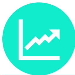
Increased Customer Base

With these conveniences of SBDI Center plan goals we wish to offer to the world our services to increase the educational, entrepreneurial and social ecosystem and enjoy the benefits of international partner and organizations, increased innovation knowledge and Costumer Base, National and International Strategic Differentiation, Sustainable Brand Reputation, Higher Revenue, Higher Customer Loyalty.