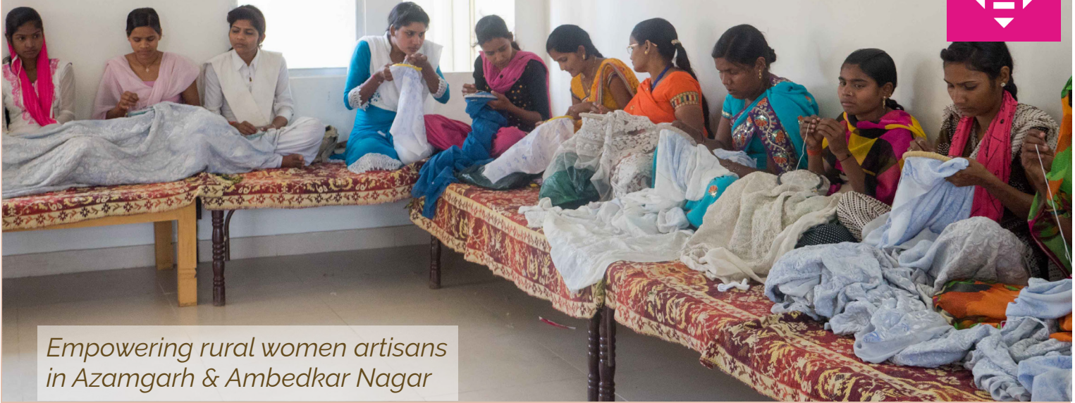
Empowering rural women artisans in Azamgarh & Ambedkar Nagar