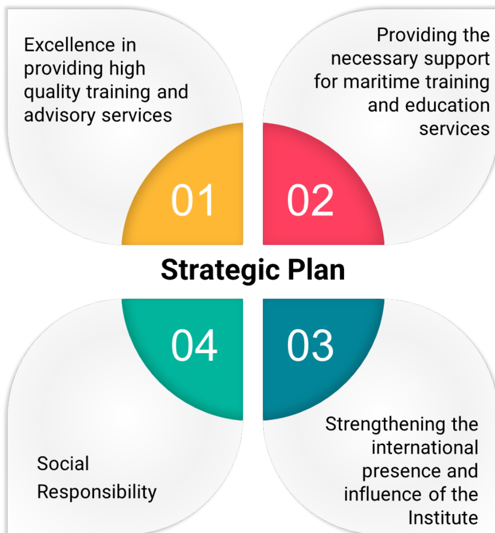
Strategic Plan Objectives