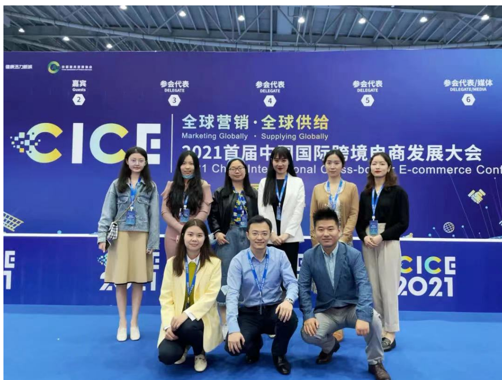
Grouphorse at 2021 China International Cross-broader E-commerce Conference