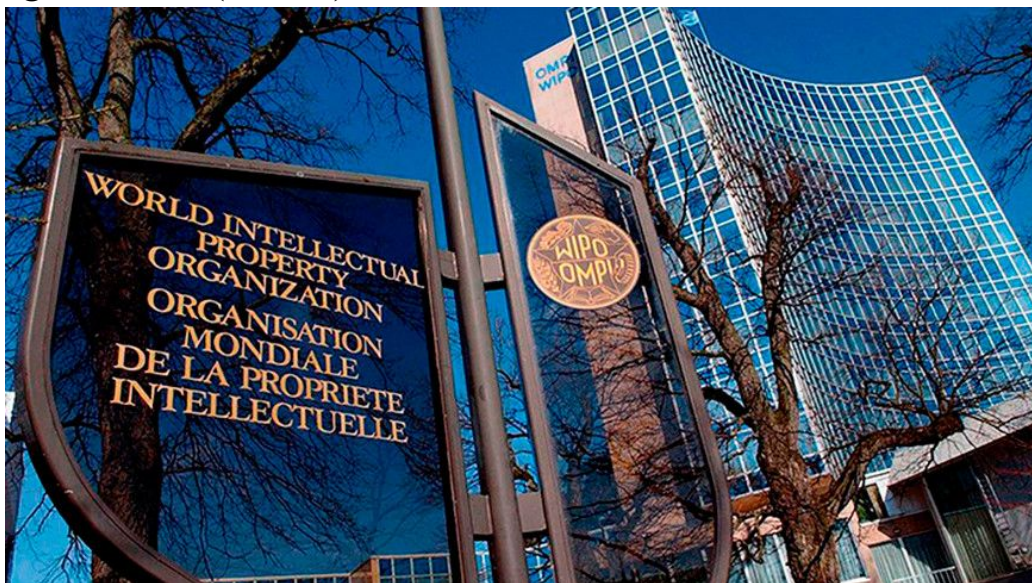
The World Intellectual Property Organization

In February, Grouphorse won the bidding of the long-term translation project affiliated to the World Intellectual Property Organization (WIPO).