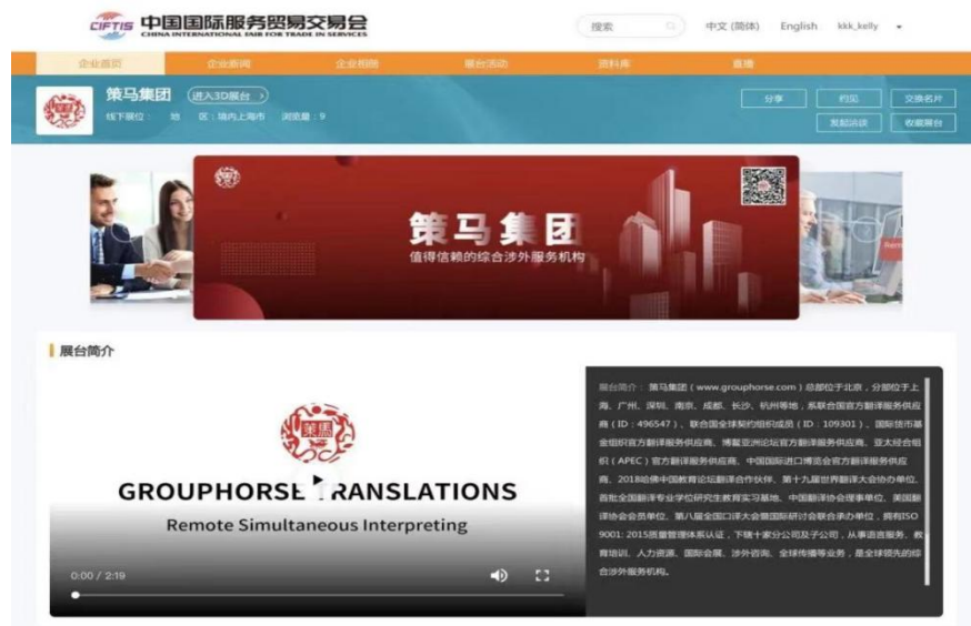
Webpage of Grouphorse on the CIFTIS (online exhibition)

On September 9, Grouphorse participated in the China International Fair For Trade in Services 2021 and provided interpreting services.