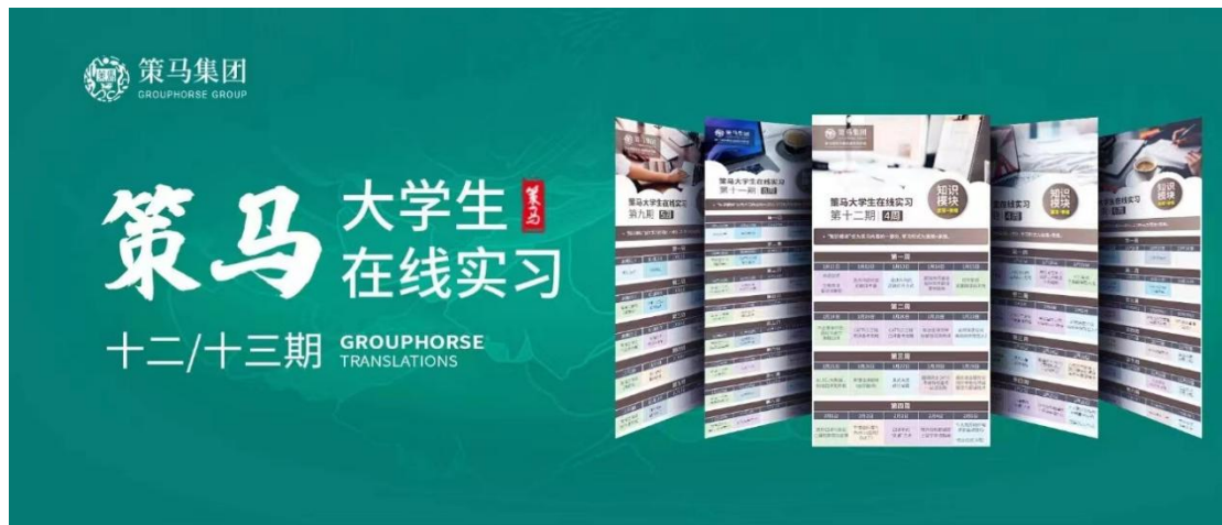
College students online internship programme

In response to the COVID-19 pandemic, Grouphorse has launched a wide range of online programs for translation and interpreting students, including an internship program to help university students at home hone their translation and interpreting skills. Candidates can choose one of the fields they are interested in to participate, including translation instructions, expert seminars, interpreting-scene observations, as well as translation and interpretation tasks, etc.