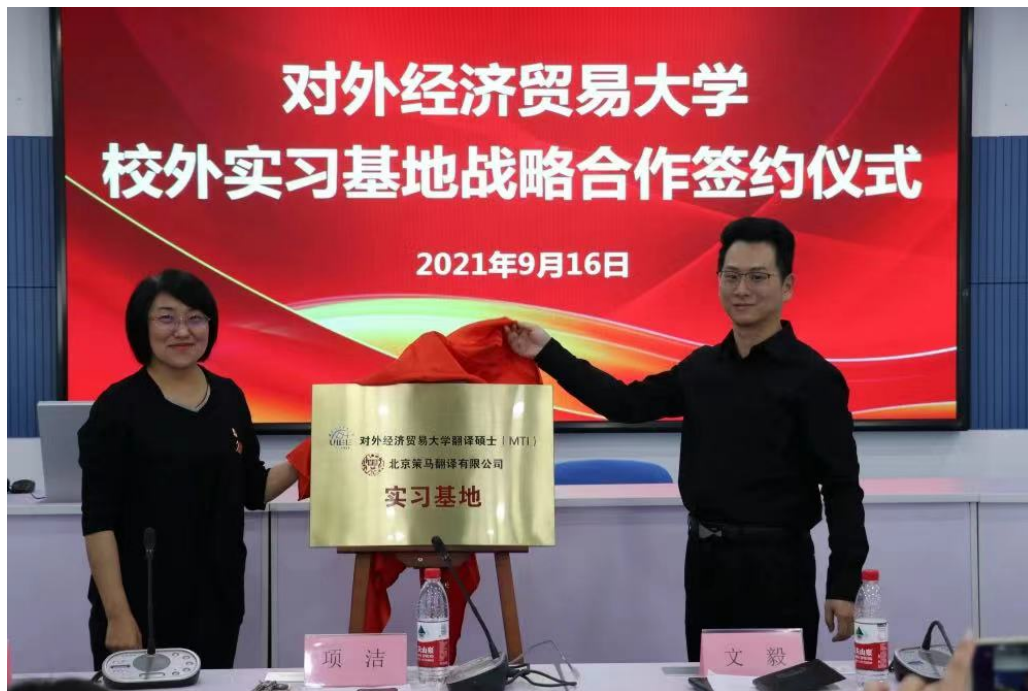
Grouphorse becomes a practice base for candidates of the MTI program offered by University of International Business and Economics in 2021