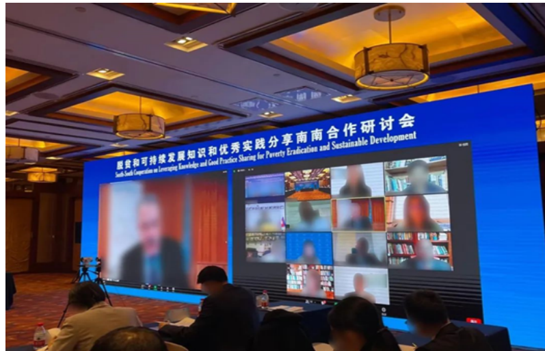
South-South Cooperation on Leveraging Knowledge and Good Practice Sharing for Poverty Eradication and Sustainable Development

Good Practice Sharing for Poverty Eradication and Sustainable Development, co-organized by CASS and UNOSSC.