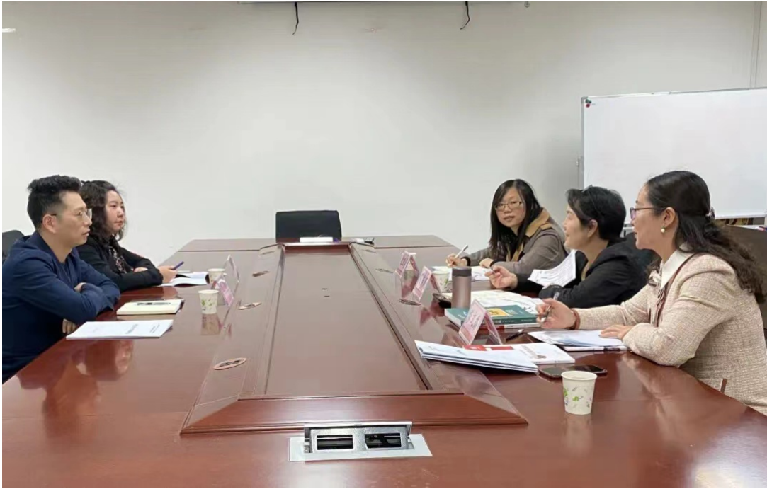
Grouphorse held cooperation meeting with China University of Petroleum, Beijing