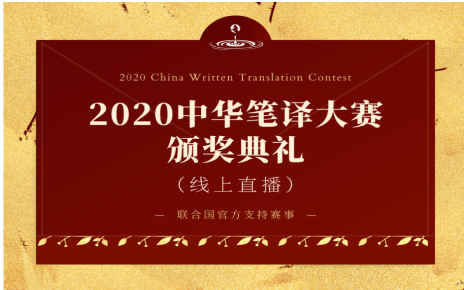
The Award Ceremony of 2020 China Written Translation Contest (Online)