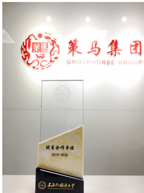
Grouphorse was rewarded for outstanding partnership by Shanghai International Studies University