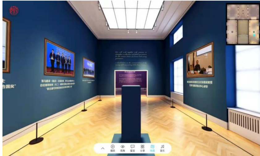
“Grouphorse and the UN” 3D exhibition

On November 30, The 2021 United Nations International Procurement Conference was held online. Grouphorse provided English-Chinese simultaneous interpretation, stenography (Chinese) and project management services. During the conference, Grouphorse interpreters performed simultaneous interpretation in the onsite simultaneous booth. This interpretation service was also available online.