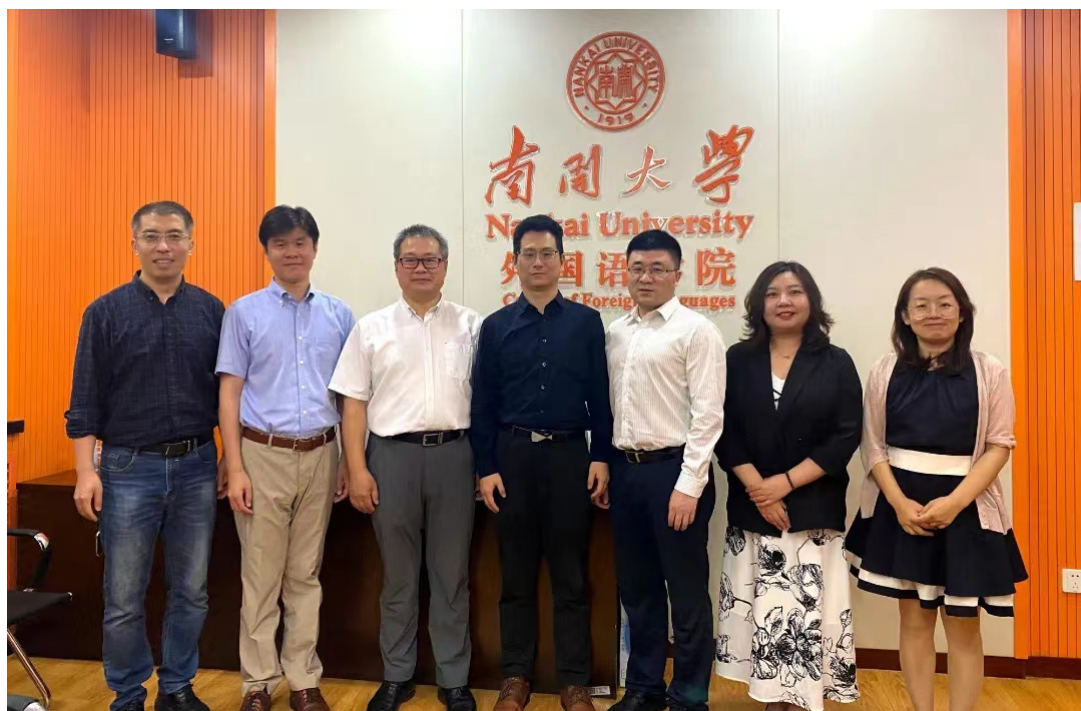
Grouphorse held cooperation meeting with Nankai University.