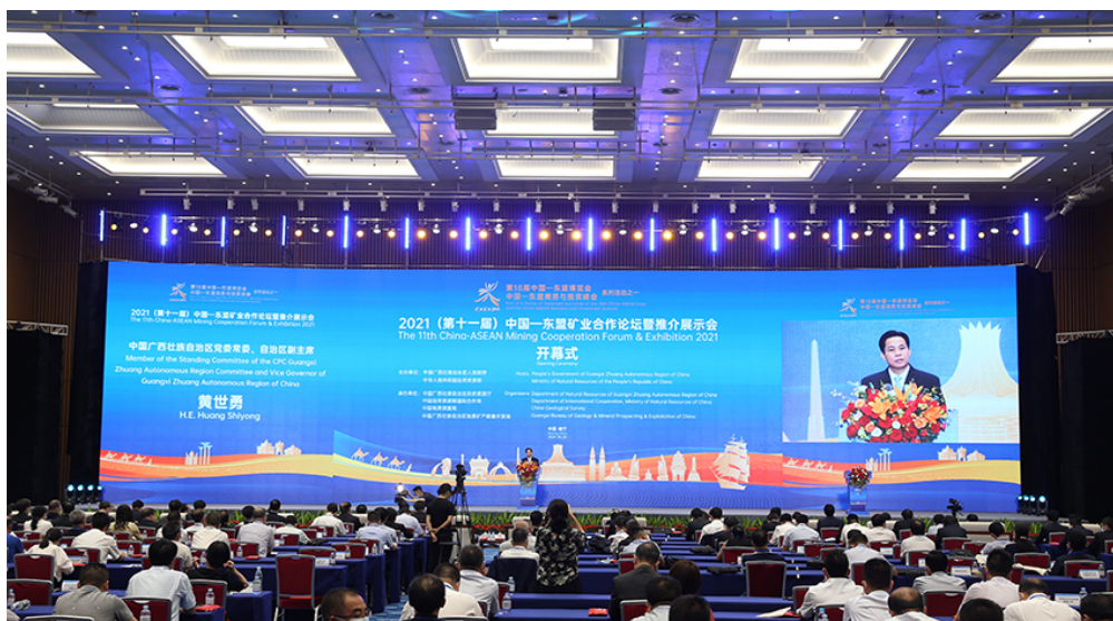
The China-ASEAN cooperation forum

In March, Grouphorse was designated a translation and interpreting service provider for the China-ASEAN cooperation forum and started to offer services for the agency.