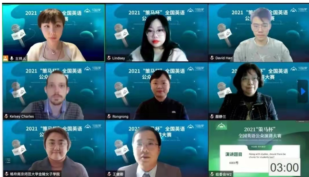
The Grouphorse Cup National English Speaking Contest

In the past years, we held major events such as the the annual meeting, the Universal Gravitation Project and the Grouphorse Cup National English Speaking Contest, to boost employee morale and to reinforce our brand image. Regular meetings and gatherings were held online to ensure greater bonds and better collaboration despite the current difficulties we all experienced.