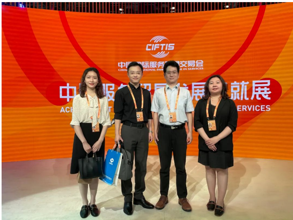
Grouphorse representatives at CIFTIS