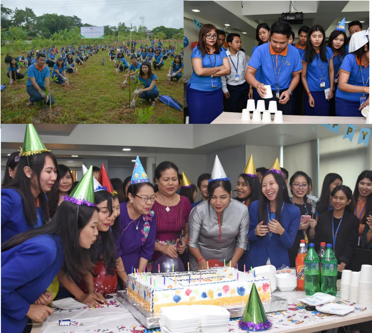
(Photos Taken Before COVID-19)

In this COP, we have also added a section which highlights the steps we have taken to provide essential banking services while keeping our employees and our customers safe.