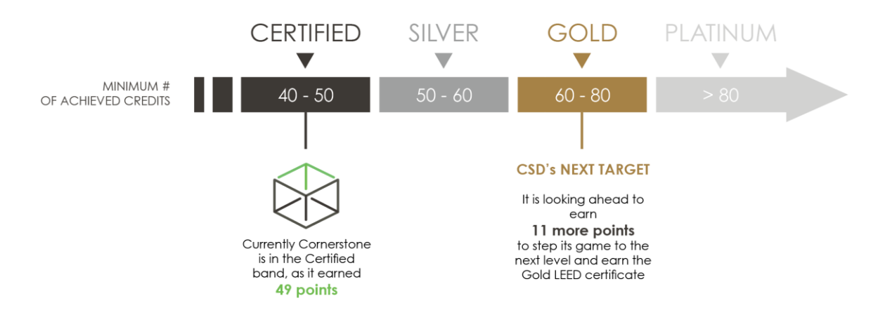
Figure 7 - Where is District //S?

Cornerstone Development is looking ahead to earn 11 more points to step its game to the next level and earn the Gold LEED Certificate.