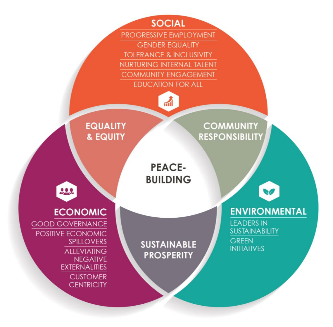
Figure 2 - Creating Shared Value Model

Our strategy comprises three pillars of sustainability that together help in creating shared value: