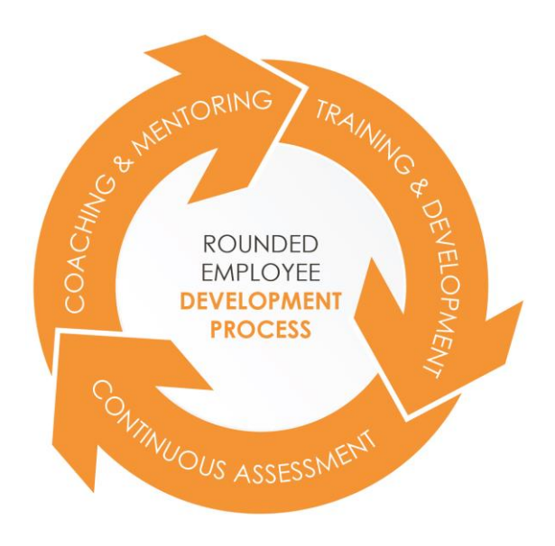
Figure 6 – A Rounded Employee Development Process