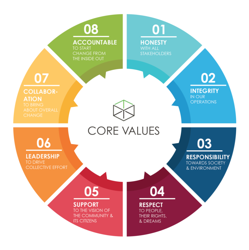
Figure 8 - Our Core Values