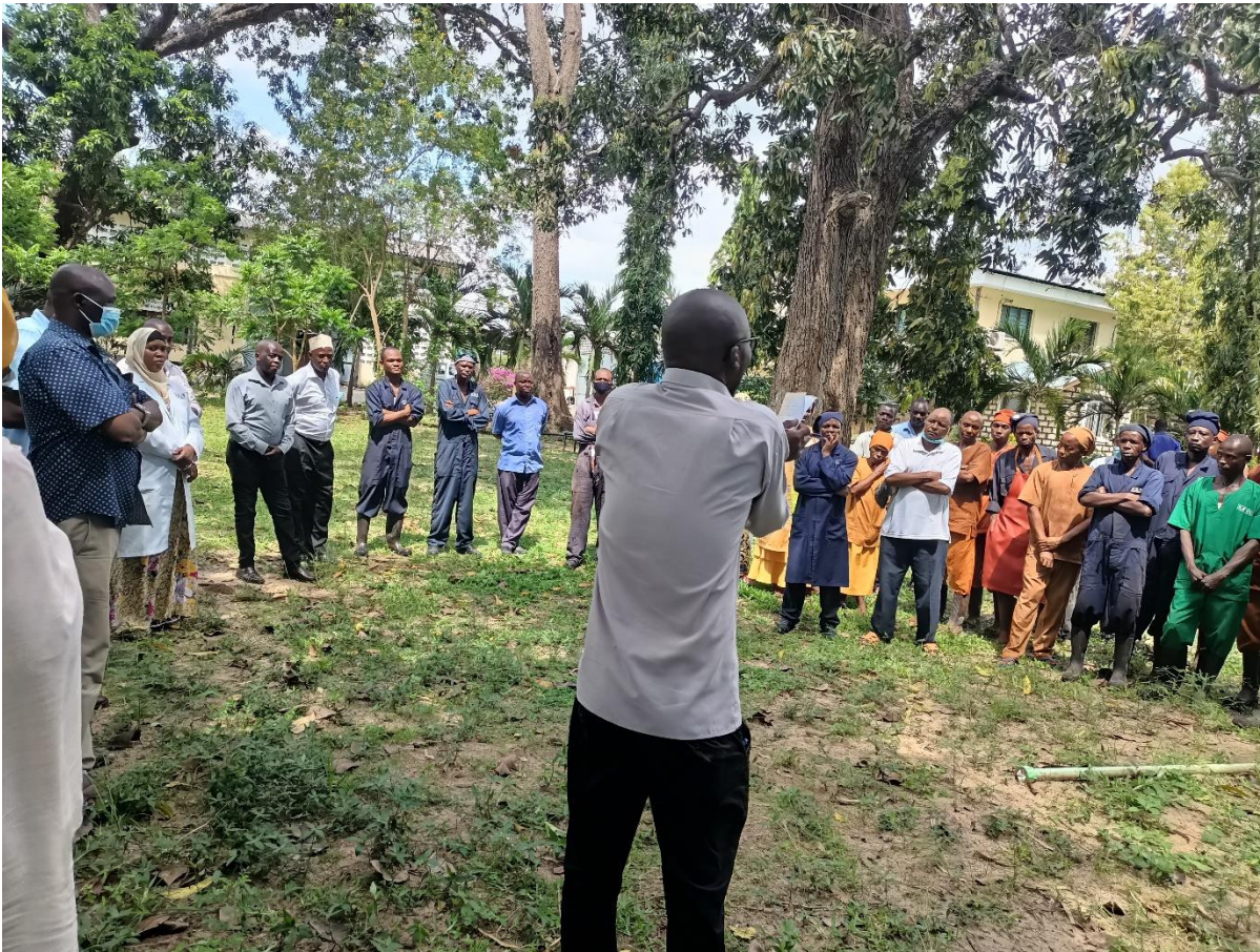
Photo of Fire Training skills By Red cross