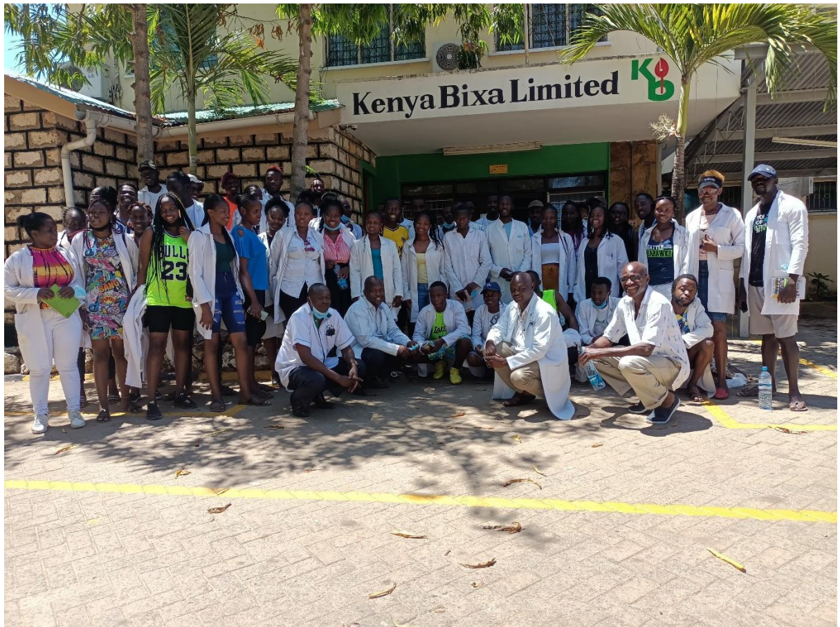
2. Photo of Technical University of Kenya with their Lecturers