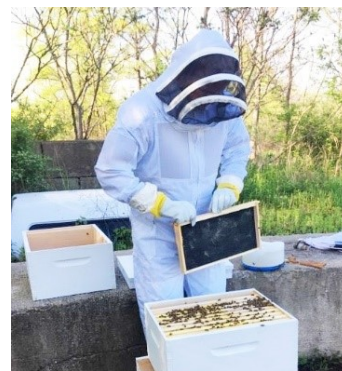
EnviroScience volunteer beekeeper tending the hive.

Our beehive had two productive years, and we learned valuable lessons about their care. Unfortunately, the original colony did not survive a winter with inconsistent temperatures. However, we plan to start again with a two-hive model going forward once Covid-19 safety restrictions are eased enough to allow for employee presence at the office building. Our bug hotels, built in 2019, remain in good repair in place near the pollinator gardens. We will continue monitoring for future inhabitants.