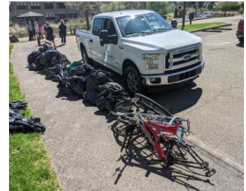
SPRING RIVER CLEANUP

EnviroScience and our teaming partners have hosted and participated in cleaning the Little Cuyahoga River just downstream of the City of Akron, removing over 75 tons of trash over the years before it is washed downstream to the Cuyahoga Valley National Park. Thankfully, we were once again able to host the semi-annual cleanup in the spring of 2021. EnviroScience hopes to expand community involvement in these cleanups further. The site location has become one of the most used areas for living and commerce in a once nearly abandoned city region. We believe that our semi-annual efforts have helped revitalize this area.