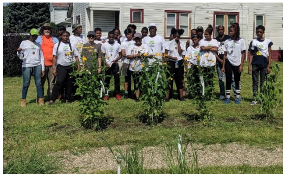
Glenville Community Garden project volunteers and participating EnviroScience staff.

In 2018, we began a partnership designed to help create a sustainable green initiative through education, mentorship, and employment. Glenville is a neighborhood in Cleveland, Ohio, and one of the most historic (and underserved) areas in the region. We led the formation of a team that includes the neighborhood Famicos Community Development Center, Western Reserve Land Conservancy, Cleveland Museum of Natural History, Holden Arboretum, Student Corps, residents, and the neighborhood elementary and junior high schools. In Phase 1 of the program, we identified