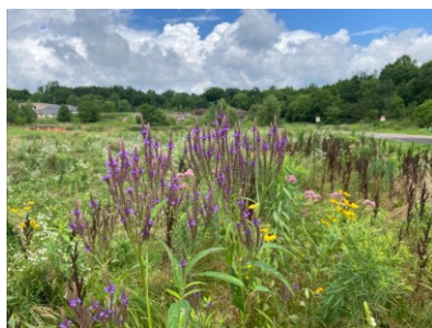
Pollinator section of the Stow Community Garden

We have continued our commitment to improving pollinator habitat in our community. EnviroScience has partnered with the City of Stow Department of Parks and Recreation on a long-term program to increase the number and health of pollinators in the area and encourage the creation of high-quality pollinator habitat. The City of Stow designated two initial spaces to serve as habitat enhancement sites: Adell Durbin Park and a section of the Stow Community Garden. Signage has been posted indicating the garden locations at these sites, which are open to the public for viewing. Residents can see many interesting species of bees, butterflies, and other insects interacting with the newly created habitat. To create the