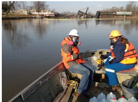
Safety First during Aquatic surveys requiring HAZWOPER.