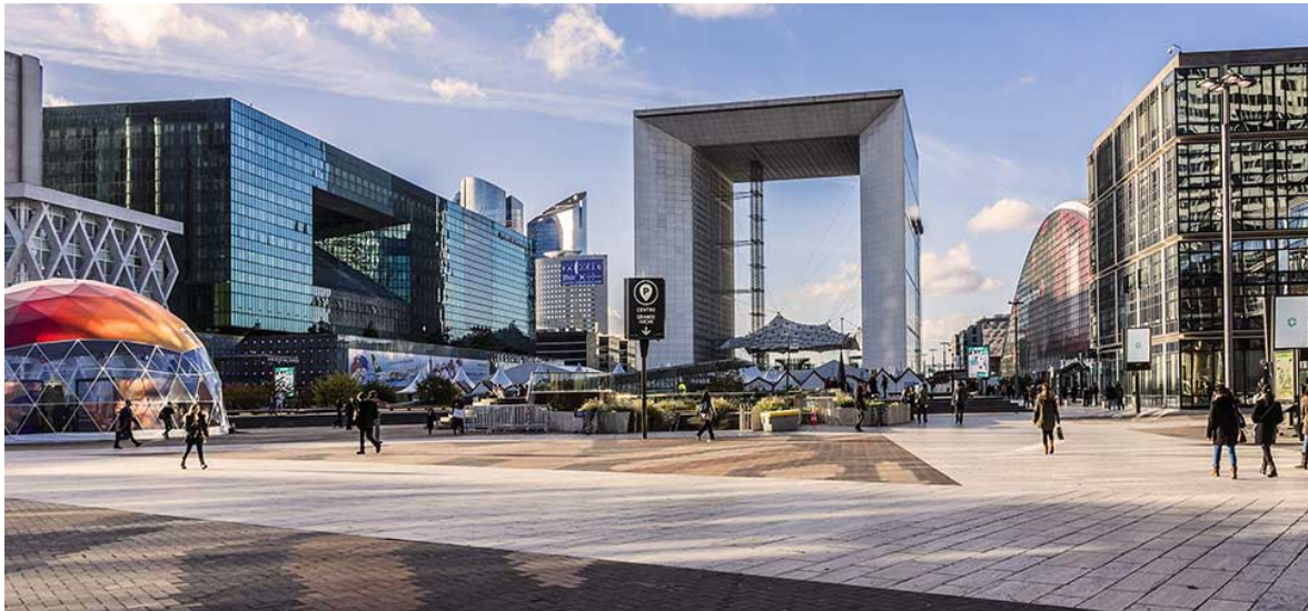
La Défense business district in Paris, where ECCO's offices are located.