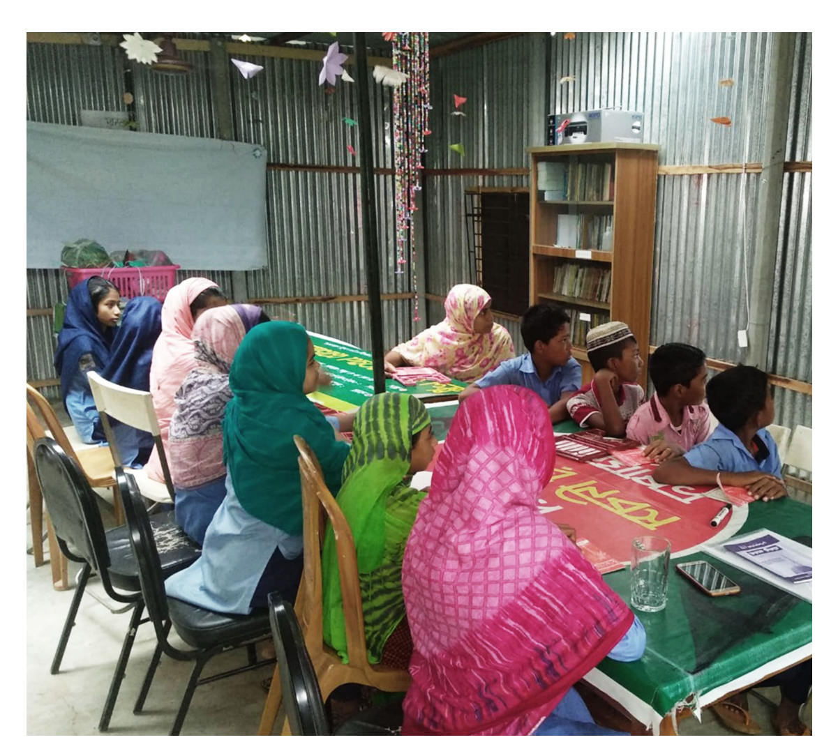
Supporting our communities: Schoolchildren attending classes at a Texprego-funded primary school