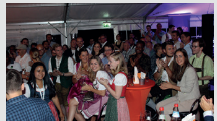
HEINE company parties