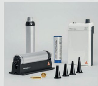
Parts & Accessories

Every day, HEINE quality instruments touch the lives of millions of people during examinations – always with the HEINE quality promise that our instruments will enable early and reliable diagnosis. In a large number of medical examinations, the aim is to detect diseases in good time and then to implement the right therapy with the most accurate diagnosis possible. This is the case, for example, with skin cancer screening – where accurate and early diagnosis can save lives.