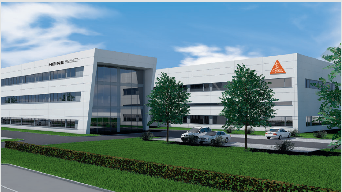
The new HEINE company building in Gilching: On the left the 3-storey administration building, on the right the production building.