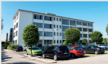
The 5 HEINE plants in Herrsching am Ammersee before relocating the company to Gilching.