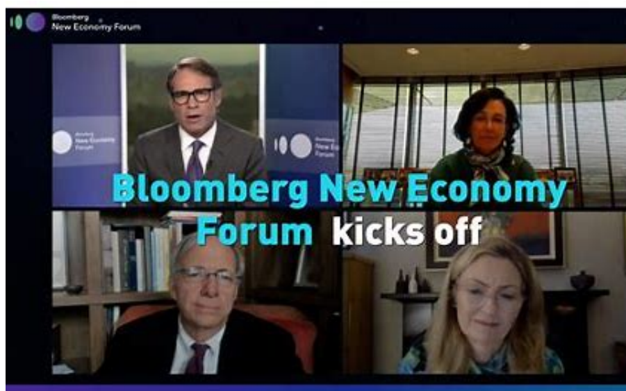
Bloomberg New Economy Forum 2020.