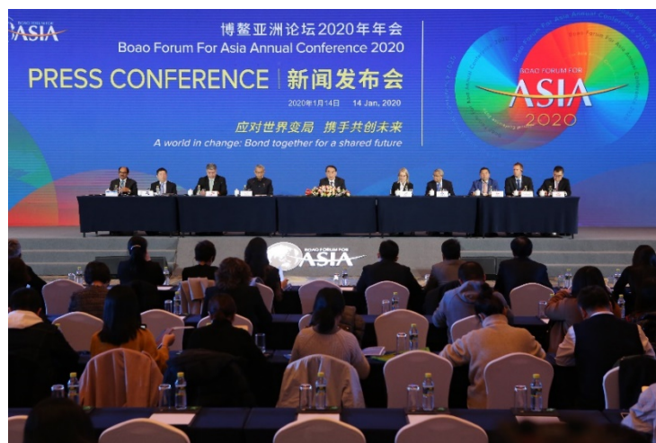
Boao Forum for Annual Conference 2020.