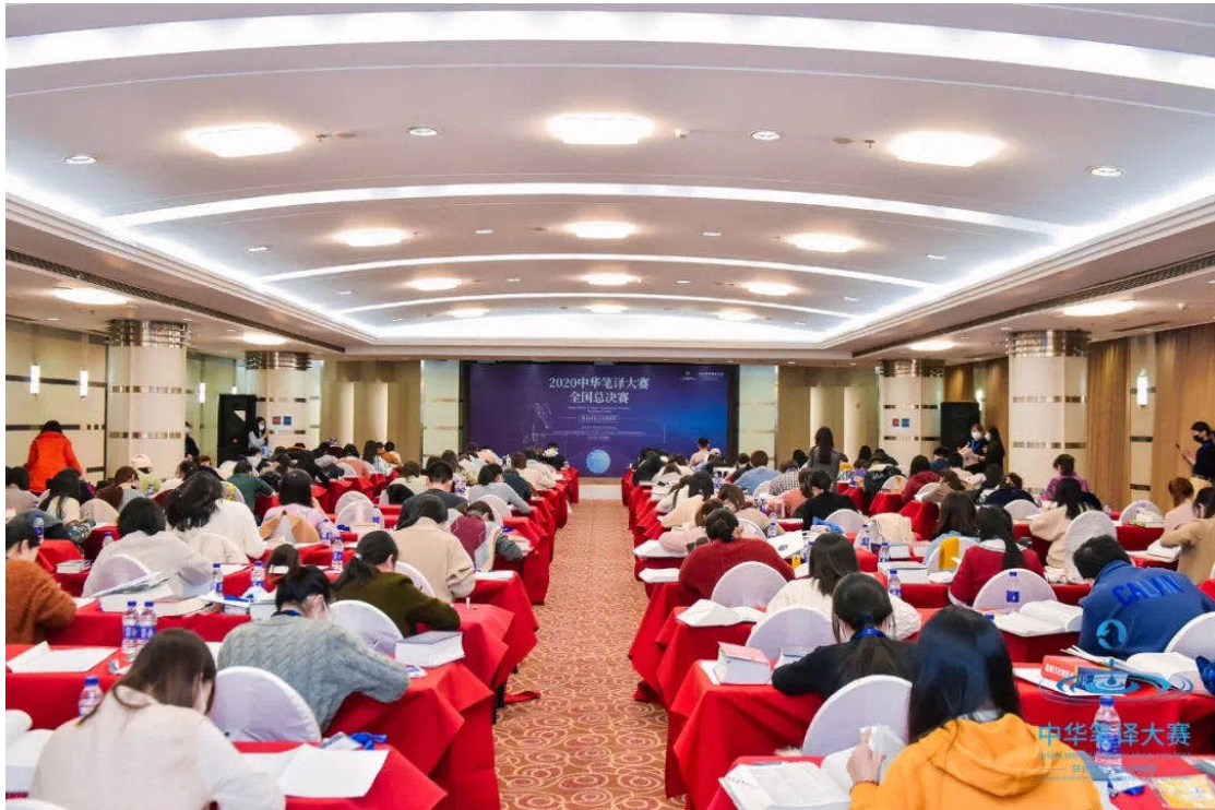
The national final of the 2020 China written translation contest.

As the year of 2020 marks the 75th anniversary of the UN since its establishment back in 1945, Grouphorse held an online 3D Photo Exhibition in Commemoration of the 75th Anniversary of the UN, themed as Grouphorse and UN, on 24 October, 2020.