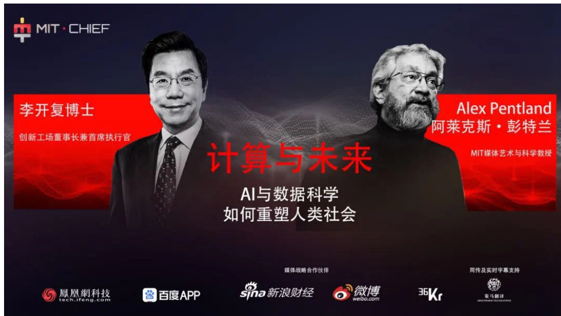
Grouphorse and MIT-CHIEF.