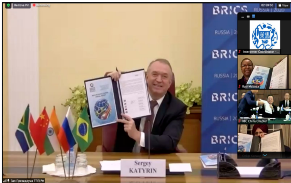
Grouphorse provides remote simultaneous interpreting services for the BRICS Business Council 2020 Annual Meeting.