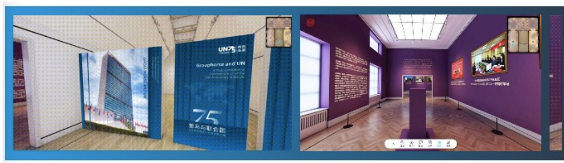
The interface of the online 3D Photo Exhibition Grouphorse and UN.

As the year of 2020 marks the 75th anniversary of the UN since its establishment back in 1945, Grouphorse held an online 3D Photo Exhibition in Commemoration of the 75th Anniversary of the UN, themed as Grouphorse and UN, on 24 October, 2020.