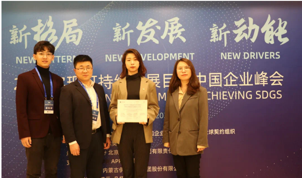
Grouphorse at 2020 China Business Summit on Achieving SDGs.

On November 10, Grouphorse was invited to attend the 2020 China Business Summit on Achieving SDGs in Beijing convened by United Nations Global Compact and was issued with a new certificate of joining the UN Global Compact.