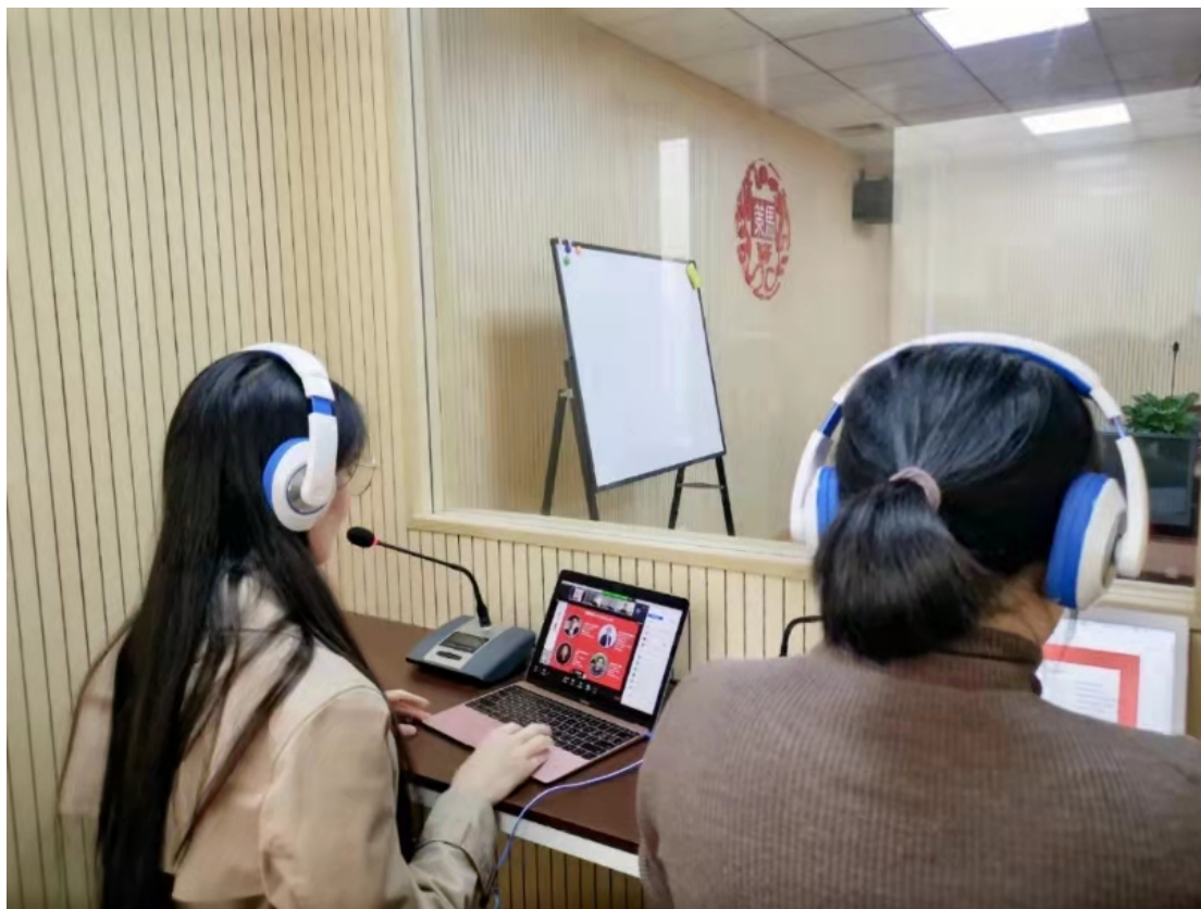
Interpreters at Harvard's 2020 China Education Symposium.