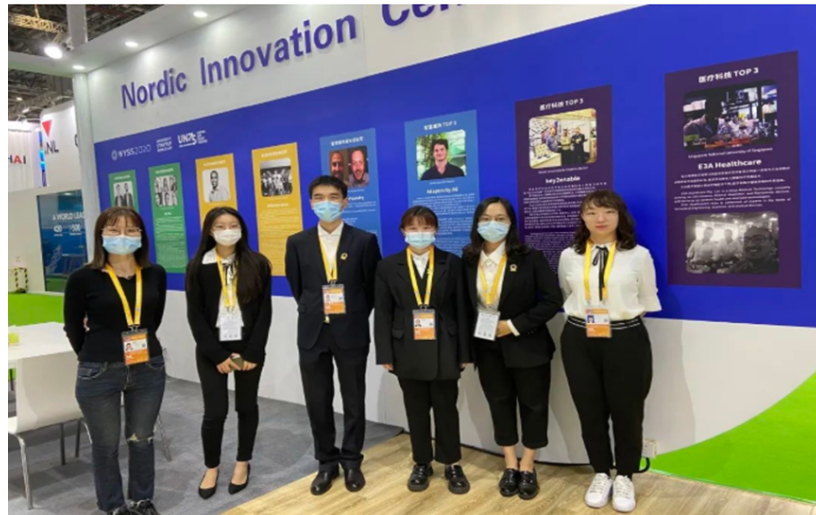
Grouphorse at the 2020 China International Import Expo.