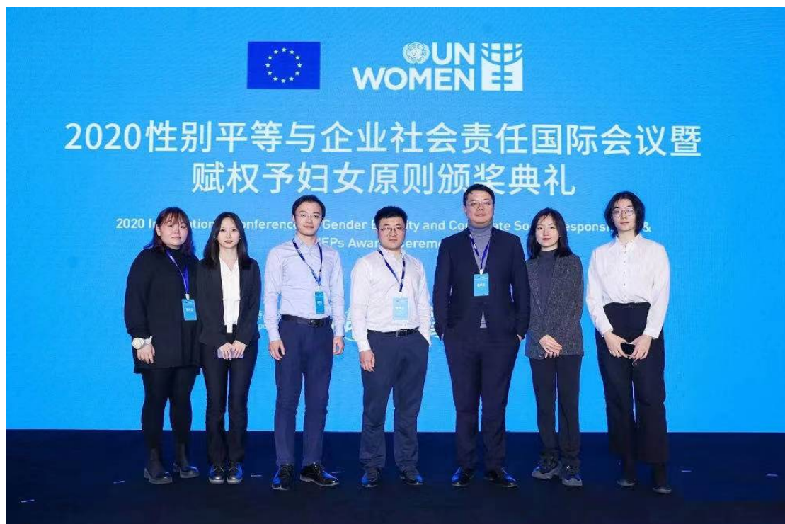
Grouphorse representatives at the ceremony.

On November 18, Grouphorse participated in the "2020 International Conference on Gender Equality and Corporate Social Responsibility" organized by UN Women and signed the "Women's Empowerment Principles".