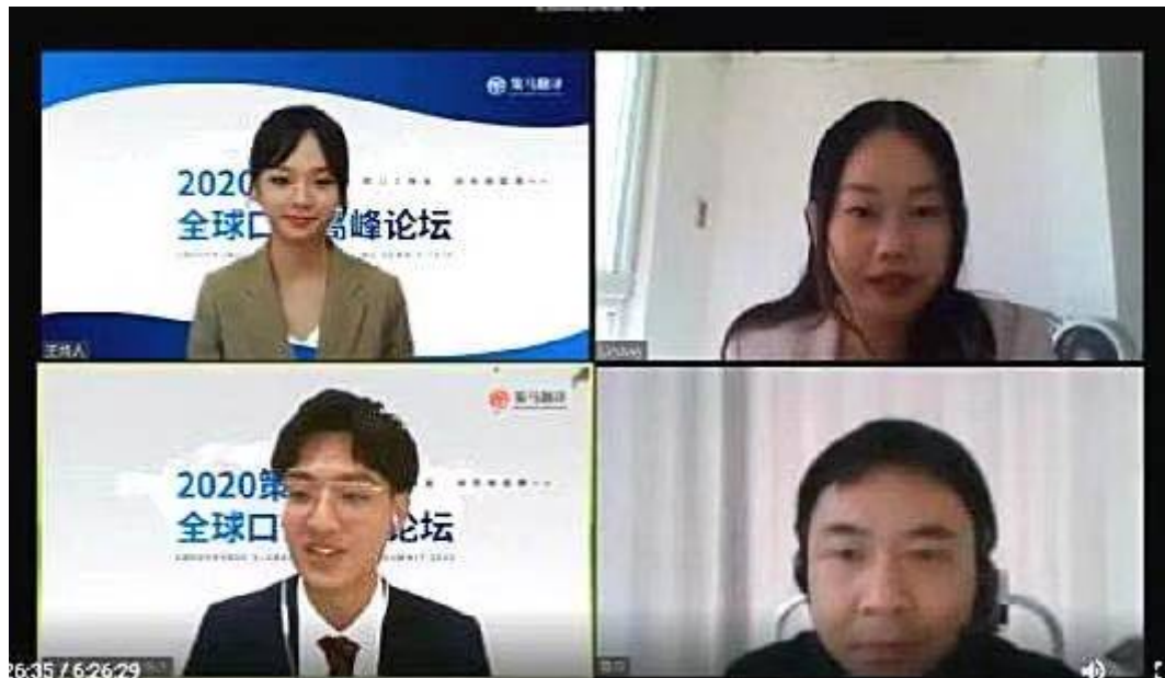
Panel discussion at the Global Interpreting Summit.

The China Education Symposium is a well-established and well-known event on Chinese education in the US. Grouphorse Translations provided premium quality remote simultaneous interpreting service at the 2020 China Education Symposium (CES), which was held over Zoom from April 18-20, Beijing Time (April 17 to 19, US Eastern Time). This was the third consecutive year that we have provided interpreting service for the CES.