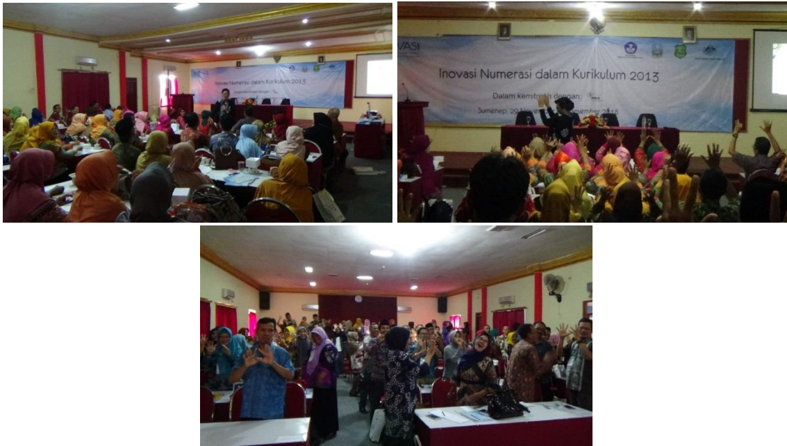
Figure 14 Documentation of Numeration Innovation Training in 2013 Curriculum in Sumenep

mathematical competencies more quickly so that their numerical skills can be developed. The approaches used during the training are presentation, demonstration, question exercises, group discussions, and performance. The Numeration Training is conducted for one year for teachers and is divided into 2 batches. The training participants included the principal, teachers, and lecturers of the PGSD STKIP PGRI.