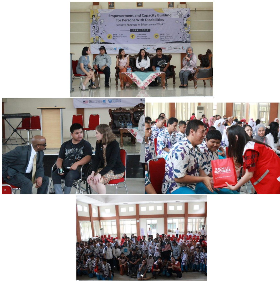
Figure 2 Documentation of Empowerment and Capacity Building for Persons with Disabilities