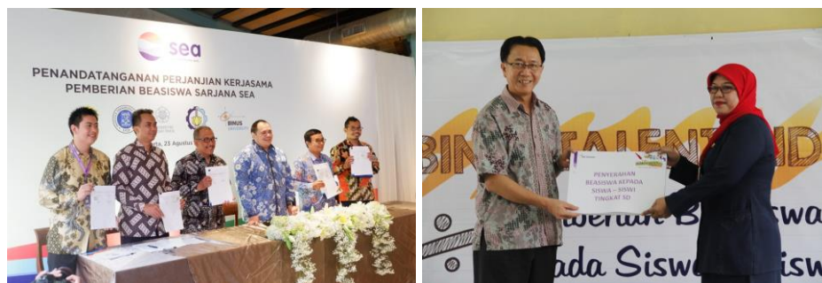
Figure 9 Documentation when Submission of Scholarship

As a real manifestation of BINUS vision in continuing to foster and empower the community in building and serving the nation, BINUS provides scholarship for high school students / equivalent. Since 2008, this program is a form of BINUS contribution and commitment to help the government in educating the nation's children. It is the duty of BINUS as an educational institution to facilitate people who have potential and want to study but are hampered by economic limitations. The scholarships given are in the form of scholarship for children of permanent lecturers, Bidikmisi scholarship and Duta Binusian scholarship.