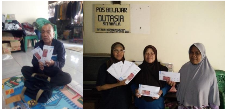
Figure 22 Documentation of Giving Foster Parents Funds

funds is that they come from pre prosperous families and donation will be provided until they finish their school.