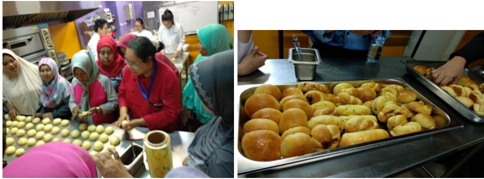
Figure 12 Documentation of Making Bread and Churros Training

In developing the competencies of school teachers in educating students so that they can be better absorb knowledge, TFI together with KOPERNIK and NHK Education, held a workshop with the theme of visual learning. The workshop was attended by 16 schools and 36 participants. Learning was focused on Science and Mathematics for teachers that presented by professionals from NHK Education Japan. It is hoped that with this workshop, teachers can more easily help students to deepen and ease absorbing their knowledge.