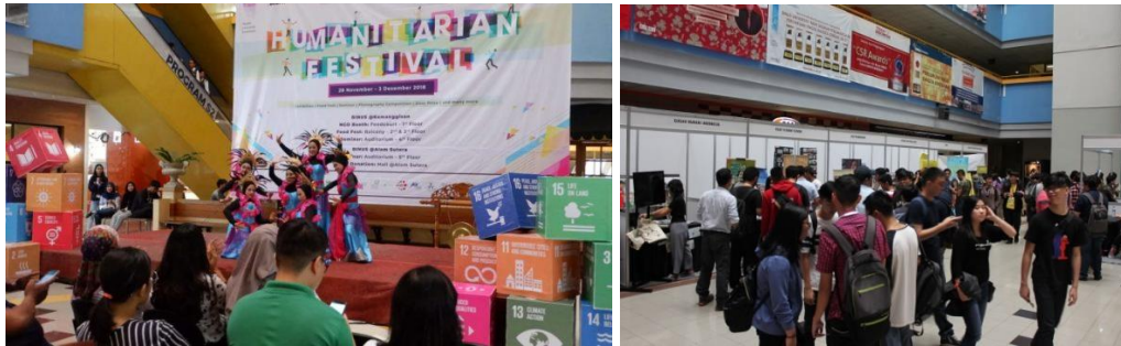
Figure 4 Documentation of Humanitarian Festival

Humanitarian Day aims to increase BINUSIAN awareness and concern for social issues that exist and develop in the community, as well as increase the interest of BINUSIAN to have a career in the NGO field. Activities were held at the BINUS University Anggrek Campus. Humanitarian Day activities consist of NGO exhibitions, awarding scholarships, competitions and MSMEs bazaars.