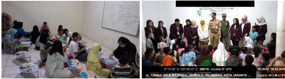
Figure 8 Documentation of Jatipulo Sub-district Evening Study Assistance Program