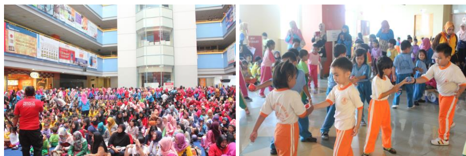
Figure 19 Documentation of Palmerah PAUD Celebration, National Education Day

The Palmerah early childhood education programs (PAUD) celebration is an activity in commemoration of National Education Day in collaboration with Himpaudi Palmerah District by holding competitions intended for increasing the creativity of early childhood. The competition was attended by all PAUD in the Palmerah District with total 650 students. In this competition, there are several categories of competitions, including a ball moving competition, a flag moving competition and a word composition competition. As long as the children participate in the competition, parents take part in the "Parenting Seminar" with the aim parents being able to care for and educate their children in the right and proper way.