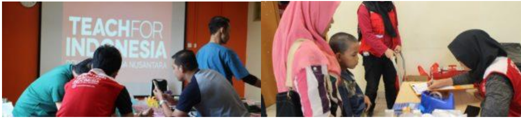
Figure 40 Documentation of Free Circumcision