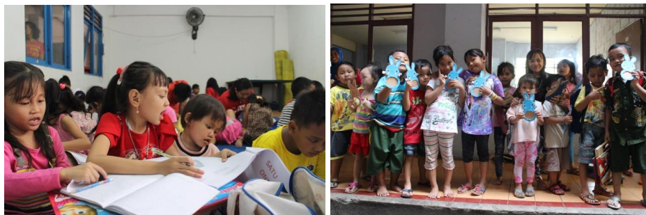
Figure 5 Documentation of Flamboyan flat Tutoring Activities

Bina Nusantara, through Teach For Indonesia (TFI) together with Global Peace Foundation (GPF), provides coaching and tutoring for children in Flamboyan flat, Cengkareng, West Jakarta. Coaching and tutoring carried out in the form of character building for the children, English, art and creativity. This activity is carried out once a week for children of the residents of Flamboyan flat.