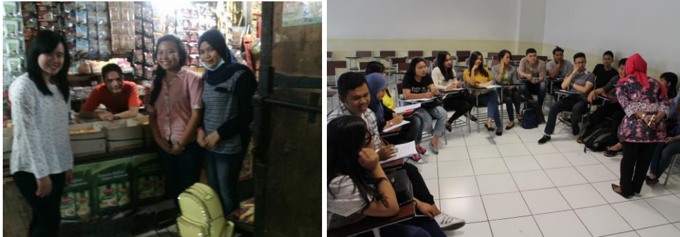
Figure 28 Documentation of MSMEs Mentoring Program

It is a MSMEs mentoring activity where students before providing mentoring to MSMEs receive training or debriefing first. The target of this program is to provide solutions for assisted MSMEs, making simple financial reports and increasing the capacity of MSMEs.