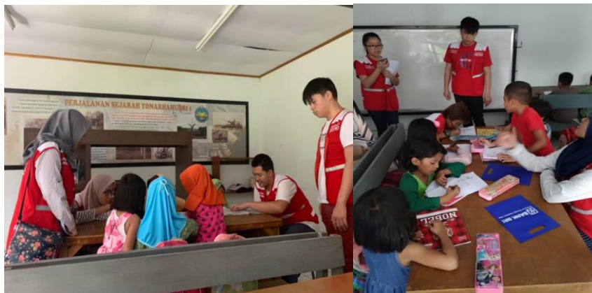
Figure 7 Documentation of Yon Arhanud 1/1 Kostrad Serpong Tutoring Activities

Yon Arhanud 1/1 Kostrad Serpong is a tutoring activity that includes learning English and Mathematics for the Elementary School.