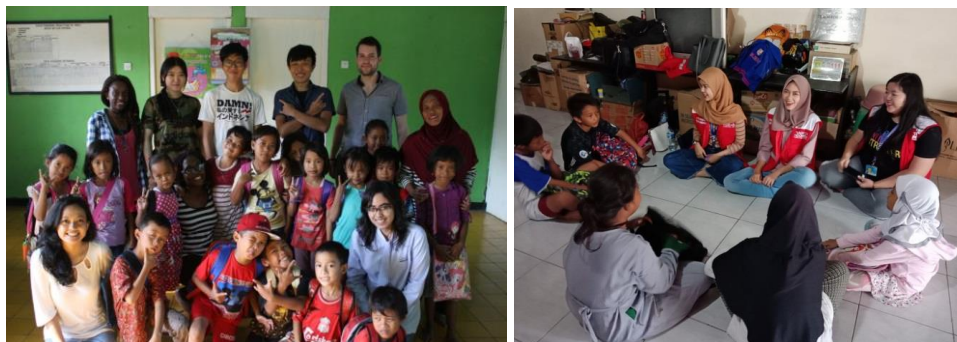
Figure 2 Documentation of Dutasia Sitanala Tutoring Activities

Dutasia Sitanala is a tutoring community located in the Tangerang area. The enthusiasm of participants and teaching volunteers are very fantastic where these activities are still running regularly.