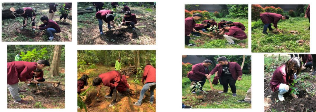
Figure 35 Documentation of Tree Planting

Due to the lack of green land in Jakarta, since 2017 TFI had a tree planting or reforestation program with the goals is that the existing vacant soil is green and fertile again. Until 2018, 4,995 trees had been planted which was involving 1,490 students.