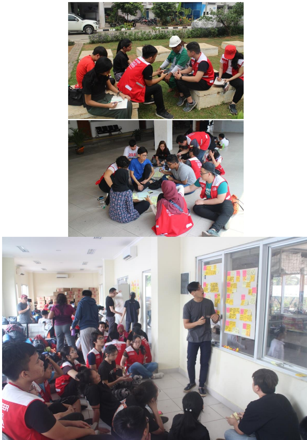
Figure 3 Documentation of LEX Program Activities