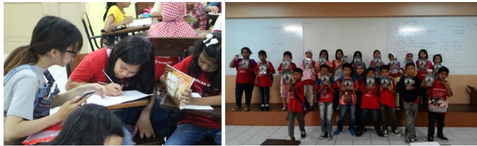
Figure 1 Documentation of Kemanggisan Tutoring Activities

The Kemanggisan tutoring program is the first tutoring program opened by TFI. The tutoring was attended by children around the Kemanggisan Campus. The learning materials consist of Mathematics, English and Art.