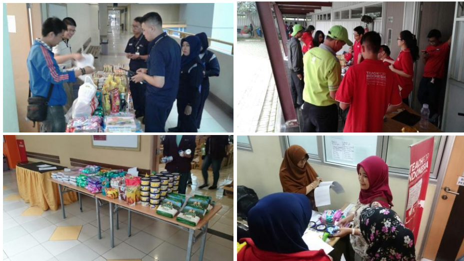
Figure 29 Documentation of Garage Sale Activities

Garage Sale is an activity of selling cheap groceries for pre prosperous society. Results from the sale of groceries are used for community development.