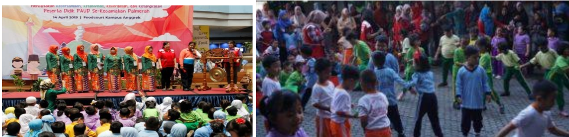
Figure 1 Documentation of the Sprit of Kartini Day

The theme of the spirit of Kartini Day is “With the spirit of Kartini Day, creating togetherness, creativity, intelligence and dexterity for PAUD students in Palmerah sub-district” The activities of the spirit of Kartini Day consisted of a flag moving competition, a ball moving competition, a word composition competition and a reading competition for the holy Al-Quran.