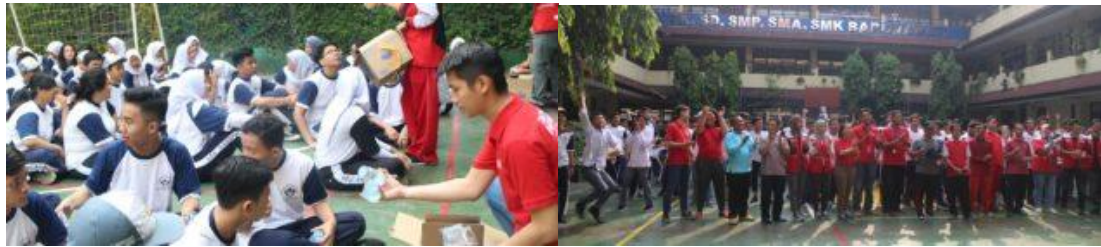
Figure 38 Documentation of Environmental Care

Conditions at the time of seasonal changes are very influential on daily human life, especially in the transition season like now. The transition season is between the dry season to the rainy season and vice versa. If someone is in an unhealthy condition, it will be very easy to develop illnesses. Therefore TFI invites the students of SMK 1 Barunawati to do gymnastics in the morning and clean the environment in order to maintain a healthy body. In addition, getting used to always washing your hands makes the body avoid germs. The cleanliness of the environment and health of the body will cause the mind to become clear so that the spirit of learning can be maintained.