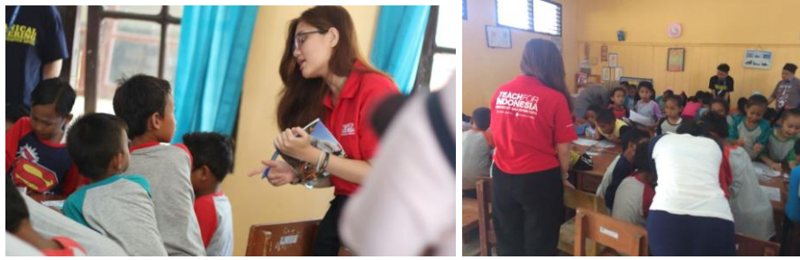
Figure 17 Documentiom of Internship “Merajut Nusantara”