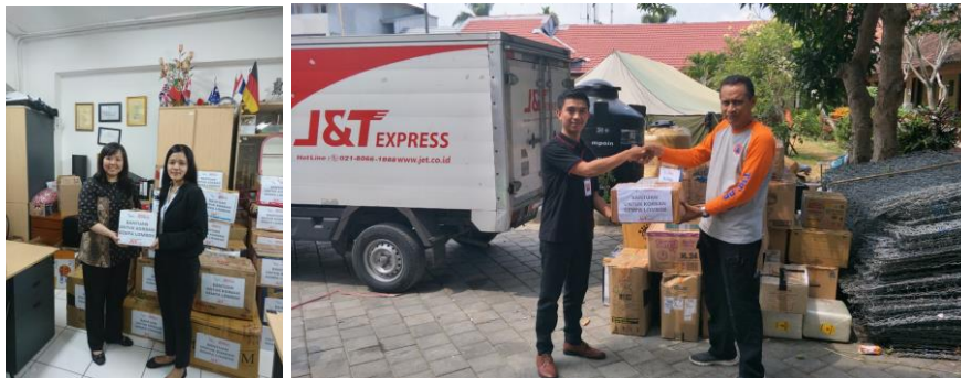
Figure 30 Documentation of Donation for Lombok Victims

victims in Lombok by raising funds and donation to help and alleviate the suffering of Lombok people. The total amount of donation items collected for being delivered to Lombok was 389 kg.