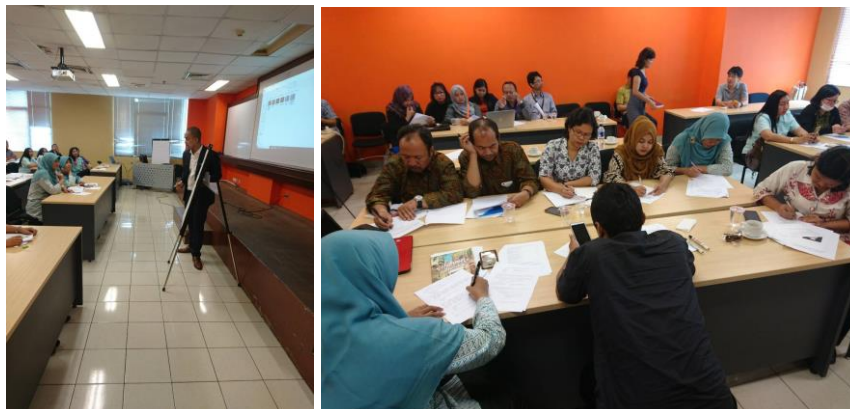
Figure 13 Documentation of "Visual Learning & Teaching Workshop"

In developing the competencies of school teachers in educating students so that they can be better absorb knowledge, TFI together with KOPERNIK and NHK Education, held a workshop with the theme of visual learning. The workshop was attended by 16 schools and 36 participants. Learning was focused on Science and Mathematics for teachers that presented by professionals from NHK Education Japan. It is hoped that with this workshop, teachers can more easily help students to deepen and ease absorbing their knowledge.