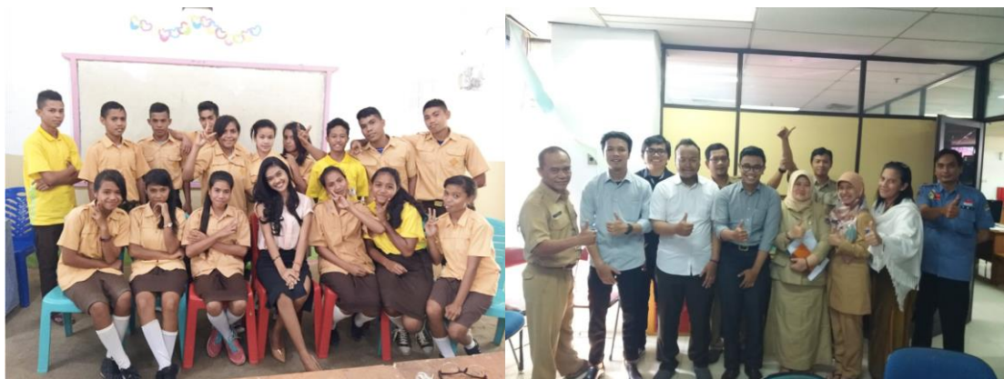
Figure 16 Documentation of Enrichment Program 3+1

Enrichment Program 3 + 1, which is followed by students with minimum time for 4 months and maximum time for 6 months where students carry out activities with the community according to their discipline of knowledge. The hope of this program is that students have real social experiences with the community so that students are good in hard skills and soft skills and the society or community are also helped by student internships. This is in accordance with the 5th BINUS mission, which reads to contribute by improving the quality of life of the Indonesian people and the global community (Improving the quality of life of Indonesians and international community). The 3 + 1 Enrichment Program is not only run in Jakarta area, but also in several big cities, such as Sumba, Bogor, Jepara, Bandung, Bali, and Magelang with partners from government and non-government institution.