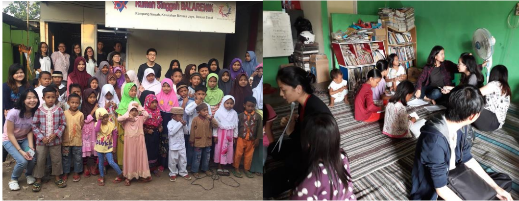
Figure 6 Documentation of Balarenik Shelter Tutoring Activities

As a form of TFI's commitment to improve the quality of Indonesian education, in 2018 TFI continues to expand the range of tutoring through cooperation with the Balarenik shelter in the Bekasi area. Routine tutoring activities are supported by voluntary students who are providing instruction to children.