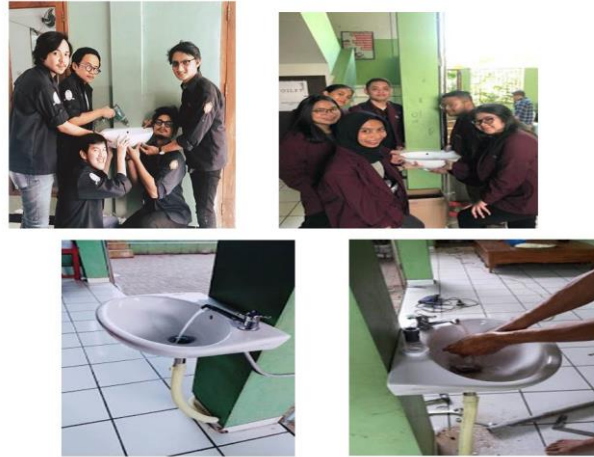
Figure 34 Documentation of Making a Wash Basin

This program is a form of BINUS (TFI) concern for the surrounding environment. The making a wash basin is carried out in areas that do not have proper hygiene facilities. The location for making a wash basin is in Jakarta and Tangerang areas.