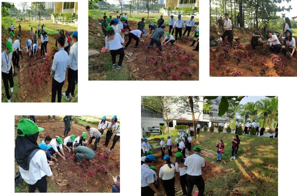
Figure 36 Documentation of Environmental Care Program

activity named ‘BINUSIANS Peduli’. As we all know the environmental conditions in the world, especially Indonesia, have undergone many changes on the negative side, such as global warming. Therefore, BINUS University through its First Year Program (FYP) with Teach for Indonesia (TFI) teaches the next generation of BINUSIANS to care about the environment. One of the activities carried out is planting trees at the Alam Sutera campus; this activity is to help reduce global warming.