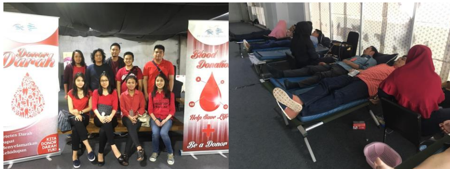
Figure 39 Documentation of Blood Donation

TFI cooperates with PT. Alam Sutera Realty, Tbk & Alam Sutera Residence Community (ASRC) organizes a blood donation program regularly every three months at Mall @ Alam Sutera. Blood donations are also conducted at the BINUS @ Alam Sutera Campus and the BINUS @ Kemanggisian Campus.