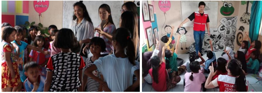
Figure 3 Documentation of Dutasia Tanjung Pasir Tutoring Activities

The Lippo Karawaci Learning Community is located in Dumpit Karawaci Village. This learning community is the third tutoring community in the Tangerang area where students are from Elementary until Junior High School.