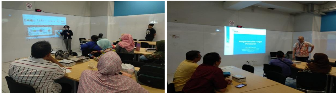
Figure 15 Documentation of MSMEs Training