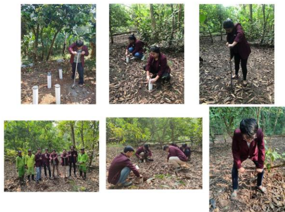
Figure 33 Documentation of Biopore Activity

Making of biopore is one of student social activity that has been carried out since 2014. The location criteria for making of biopore are schools, city parks, city forests, empty land or public places that have received permission from local government or local officials. Until 2018, 6,565 biopore had been made which was involving 4,000 students.