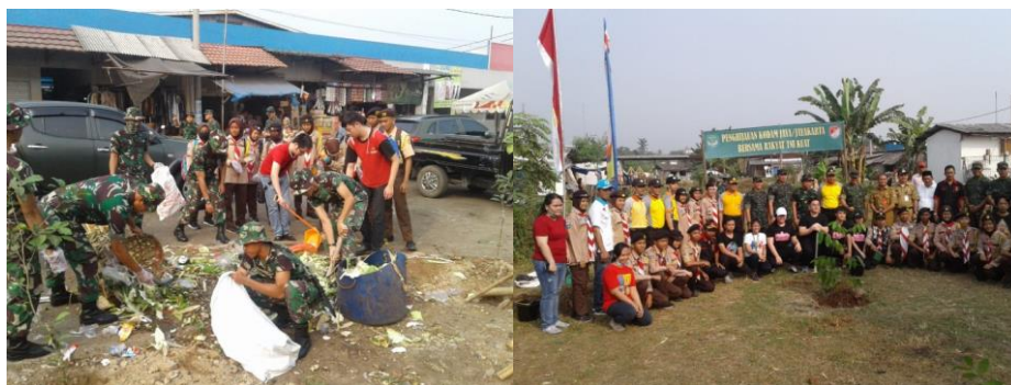
Figure 37 Documentation of Large Scale Community Service

This activity was carried out in order to commemorate the community service of Indonesian National Army (TNI) with the society to execute environmental clean-up actions around the Sentiong market in Balaraja Tangerang area. This activity was held on July 24, 2018 in Sentiong market Balaraja, Kp. Paku Aji, Tobat Village, Kec. Balaraja, Tangerang by Kodam Jaya together with the district Muspida, elements of the TNI / Polri, community organizations and students.