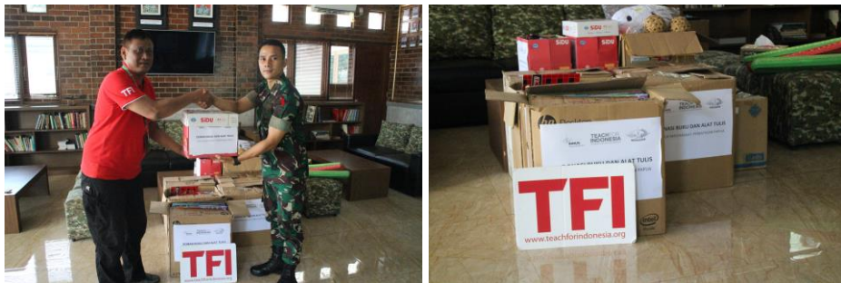
Figure 20 Documentation of Donation Delivery to Papua

Yonif Para Raider 328 as the duty bearer guarding the border of Republic of Indonesia and Papua New Guinea which carries out security activities is also in charge of carrying out development in the field of education. Teach For Indonesia also supports the implementation of this duty by sending donation in the form of educational support equipment in the form of writing books, stationery, and educational toys. With this donation, it is hoped that it can increase the enthusiasm for learning for younger siblings in the Papua border area.