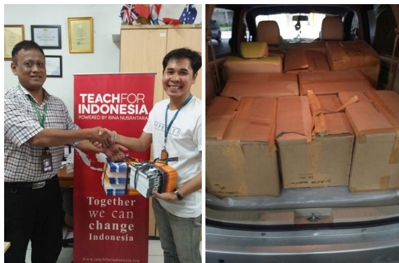
Figure 21 Documentation of Books Handover

In fulfilling the need for reading books in isolated rural areas, TFI in collaboration with the Buddhist Tzu Chi Foundation collaborate in the field of book collection. The total books collected were 2,319 books.