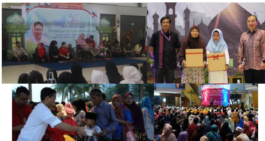
Figure 31 Documentation of Break Fasting Together

Every year BINUS regularly holds break fasting with the society around the campus, orphanage foundations and community accompanied by the distribution of groceries. Break fasting together always held at the Anggrek Campus, Alam Sutera Campus and in the community. TFI regularly collaborates with Puan Amal Hayati Foundation in organizing break fasting for the community.