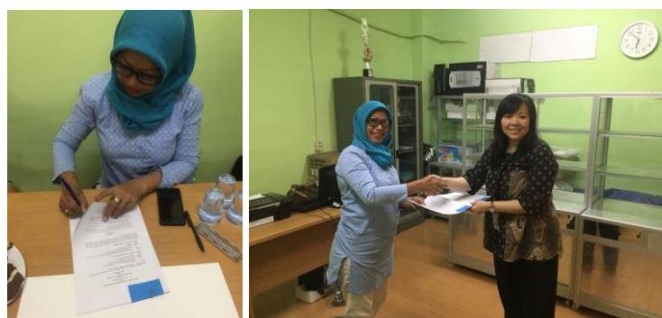
Figure 27 Documentation of Revolving Fund with Flamboyant Flat Representative