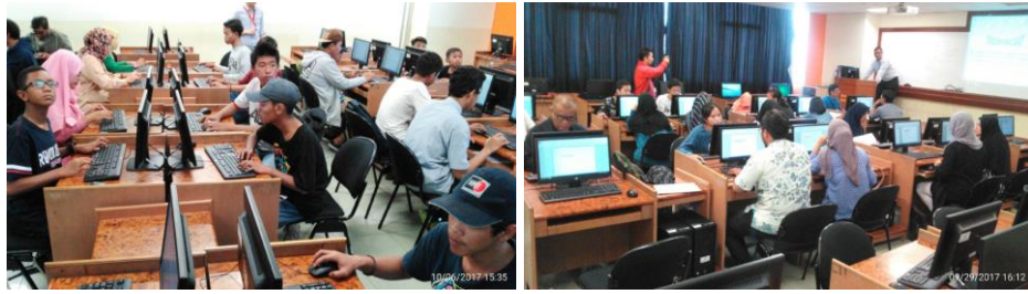
Figure 10 Documentation of Ms. Office Training for Kota Bambu Utara Community

We realize that the rapid development of technology require public understanding to be able to make good use of it. Therefore, TFI conducts computer training by providing adequate computer equipment, interesting material and reliable lecturers with the aim of improving the skills of the Palmerah community.