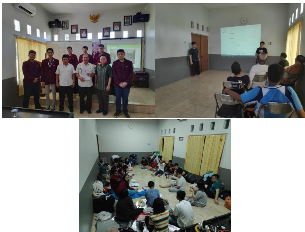
Figure 18 Documentation of Internship “Citarum Harum”– Segaran Village