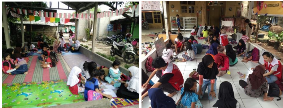
Figure 4 Documentation of Dutasia Lippo Karawaci Tutoring Activities

The Lippo Karawaci Learning Community is located in Dumpit Karawaci Village. This learning community is the third tutoring community in the Tangerang area where students are from Elementary until Junior High School.