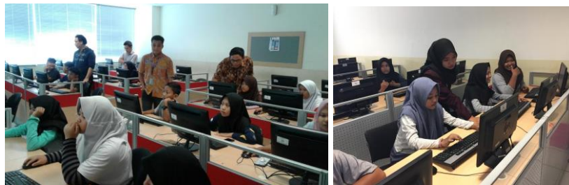
Figure 11 Documentation of Ms. Office Training for Palmerah Community

We realize that the rapid development of technology require public understanding to be able to make good use of it. Therefore, TFI conducts computer training by providing adequate computer equipment, interesting material and reliable lecturers with the aim of improving the skills of the Palmerah community.