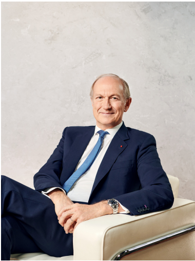
Jean-Paul AGON Chairman and Chief Executive Officer

Our Ethical Principles – Integrity, Respect, Courage and Transparency – guide our development, contribute to our reputation and notably form the foundation of our policies on sustainability, social and societal responsibility, compliance and philanthropy.