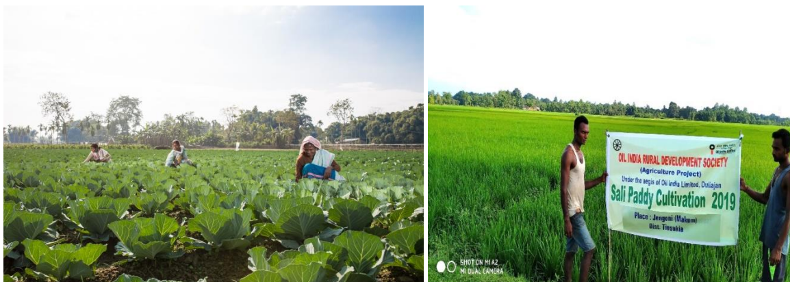
A glimpse of the Agriculture Project of OIRDS