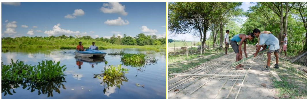
A view of the wetland, Sasoni Merbeel, in Dibrugarh district, Assam