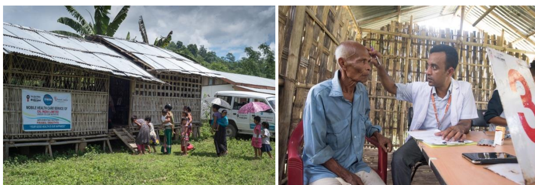
Mobile Dispensary services under Project Sparsha , being provided to local people of OIL operational areas of Assam and Arunachal Pradesh