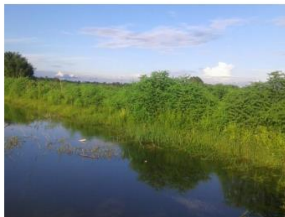
Glimpse of restored abandoned well site at Loc. Phillobari, Assam

On 14.09.2018, a leakage from Baghjan-Duliajan COD line reached to the mouth of Maguri Motapung Beel through an adjacent water stream. Considering the sensitivity of the issue, the proximity to Maguri Motapung Beel and for protection of surrounding eco-system, OIL took the challenge to remediate the difficult terrains of Maguri wetland through Bioremediation process on fast track basis.