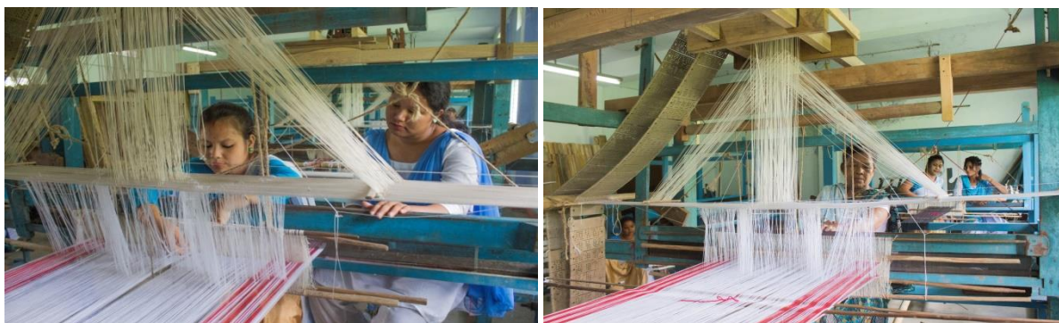
Trainees at the HTPC centre, practising the art of weaving