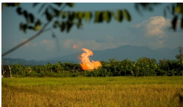
OIL aims at reduction of Gas Flaring through initiatives such as the one mentioned above

implementation of an environment friendly technology. Presently the Project is under Environmental Clearance State.