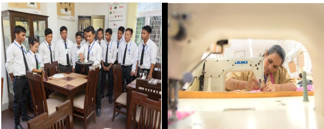
Candidates of Project Swabalamban undergoing training in various vocations