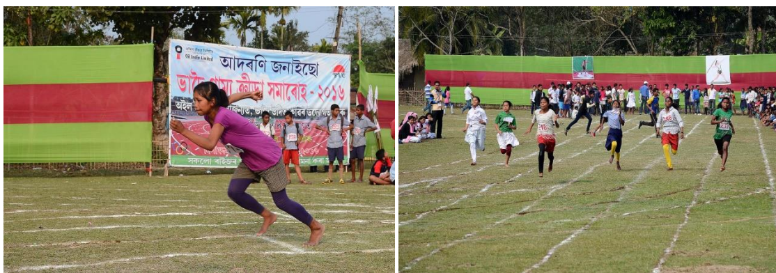
Young children participating in the OIL Rural Sports initiative

the rural areas creating social advantage, over the years.