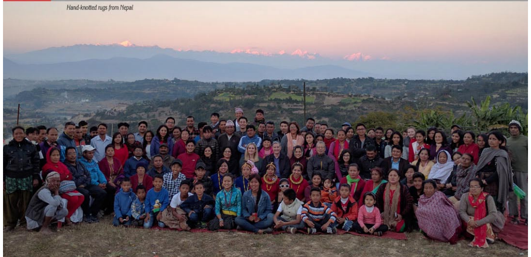
FORMATION CARPETS PICNIC, SATURDAY, NOVEMBER 12, 2016 (KARTIK 27, 2073), DUKUCHHAP (DC).