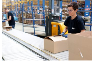
A recognized sustainable performance