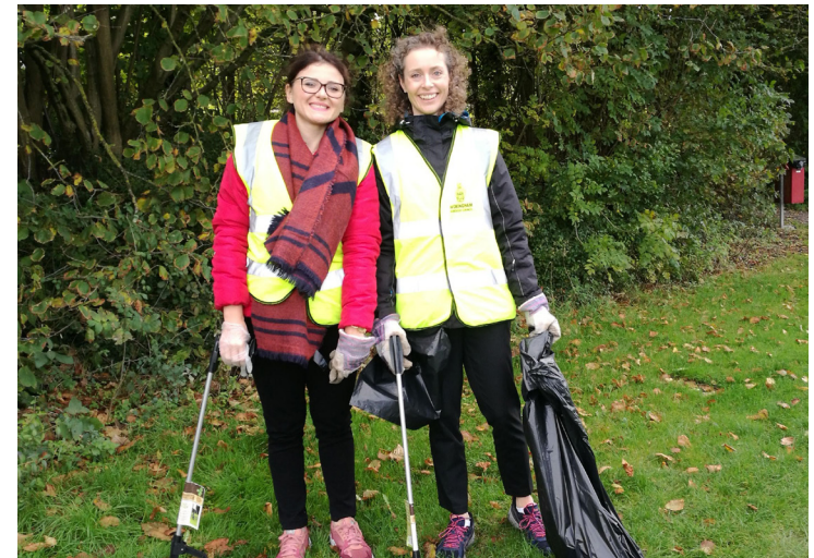
OpenText employees recognize and celebrate Earth Day annually.

Employee education and engagement —Employees are encouraged to take action on their own to help protect the environment. For example, during Earth Week, they are challenged to do one thing for the environment and post and share achievements on our internal social network. This year we celebrated Earth Day by encouraging at-home and online activities to support social distancing and still recognize the challenges of climate change.