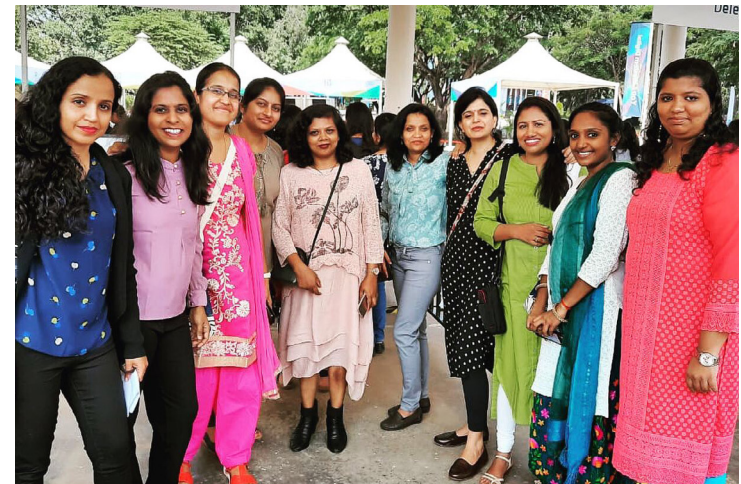
2019 OpenText Grace Hopper Delegation India

We also recognize the importance of increasing female representation in the technology industry, and created the Women in Technology (WIT) program to advance gender equality. Each year, we send delegates to the Grace Hopper Celebration, the world’s largest gathering of women in technology. The women we send are trailblazers at OpenText, inspiring and emerging leaders who will drive change in our company and beyond.