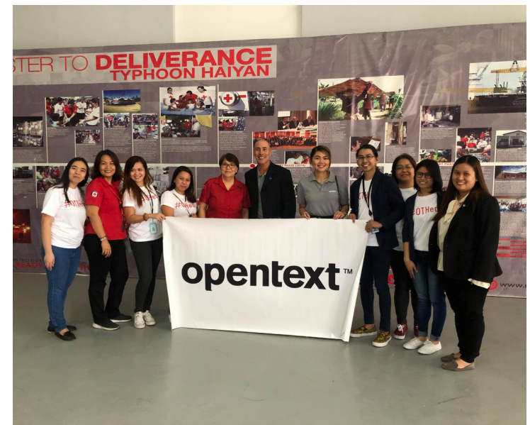
Team OpenText in Philippines supporting the Red Cross Taal Volcano Relief efforts

An outline of our corporate giving eligibility criteria can be found online here.