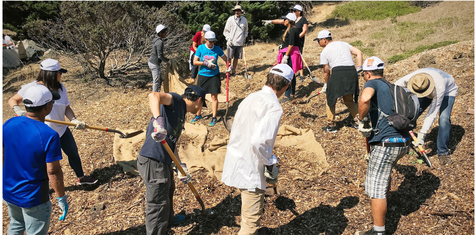
Team OpenText in San Mateo tree planting and doing a beach clean-up.

Sao Paulo, Brazil —We made a donation to FUMCAD, the Municipal Fund for Children and Adolescents. Our team visits group homes, nursing homes and orphanages to spend time with residents and donate food and clothing.