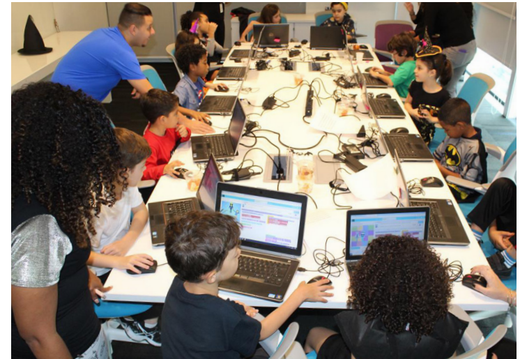
OpenText offices around the world celebrate Hour of Code with families.

To inspire young women to pursue careers in STEM (science, technology, engineering and mathematics) fields, OpenText sponsored the Northeast Collegiate Cyber Defense Competition (NECCDC) in March 2019. Our offices around the world also hosted Hour of Code events, which teach coding basics through fun and interactive computer games designed to stimulate early interest in STEM fields. Last year, we reached more than 400 children through events at our Gaithersburg (U.S.), Waterloo (Canada), Grasbrunn (Germany), Reading (U.K.), São Paulo (Brazil), and Hyderabad (India) offices.