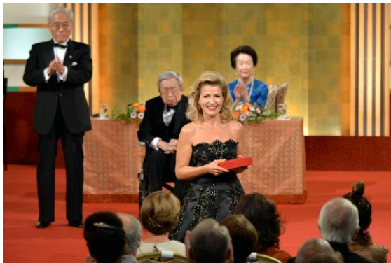
▶ Official Website http://www.praemiumimperiale.org/

The Praemium Imperiale is a global arts prize awarded annually by the Japan Art Association. Since its inauguration in 1988, it has become a mark of the arts. Late Prince Takamatsu who served as the association’s honorary patron for years has wished to contribute to enhancing and promoting the cultures and arts in the world. Six nomination committees, each chaired by an International Advisor, propose candidates in five fields: Painting, Sculpture, Architecture, Music and Theatre/Film. Fuji Media Holdings is aligned with the spirit of the Praemium Imperiale, and fully supporting this award since its start.