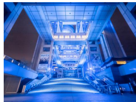
Fuji TV Building "Light It Blue" in tribute to frontline healthcare workers

With the aim to increase public awareness and support for critical social issues, Fuji Television has been putting on a new illuminations AURORA∞ by lighting up its headquarters building in the cause colors of various nationwide/worldwide awareness campaigns, such as World Autism Awareness Day [Blue] and Pink-Ribbon Campaign.