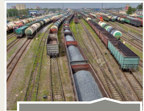
Road & Rail