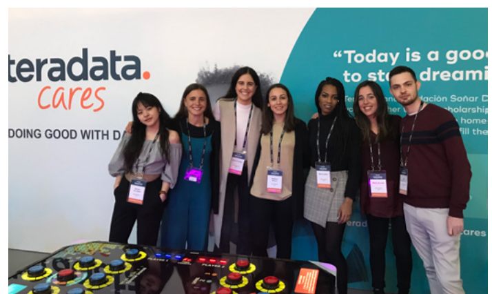
Teradata Universe, Fundación Soñar Despierto.

During our European customer conference, Teradata Cares supported Fundación Soñar Despierto, whose mission is to support kids living in foster care institutions in Spain from childhood to independence. Through combined Teradata and customer donations, the organization received more than $10,000 to support their inspiring mission.