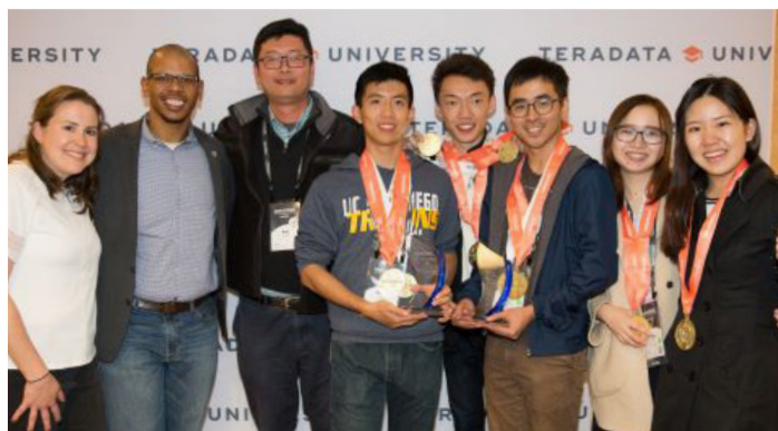
People's Choice Winner & Most Value to Hire Heroes USA – University of California San Diego, USA.