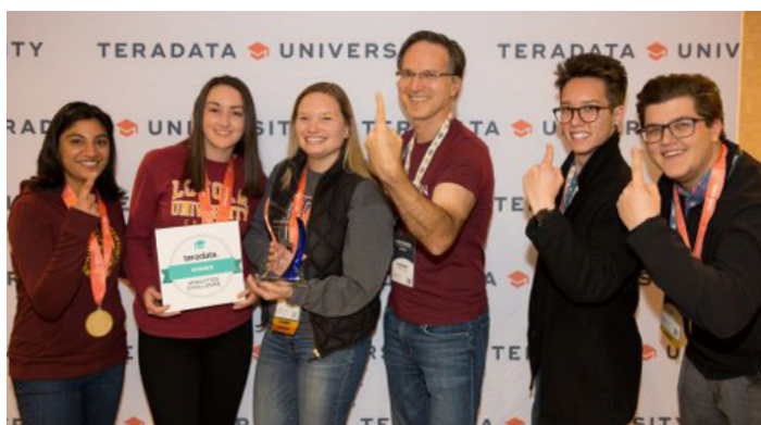
Best Visualization Winner – Loyola University Chicago, USA.