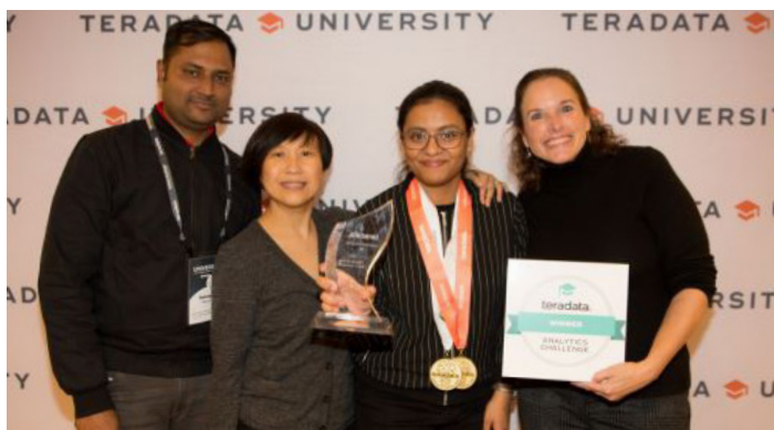
People's Choice Winner – Asia Pacific University, Malaysia.