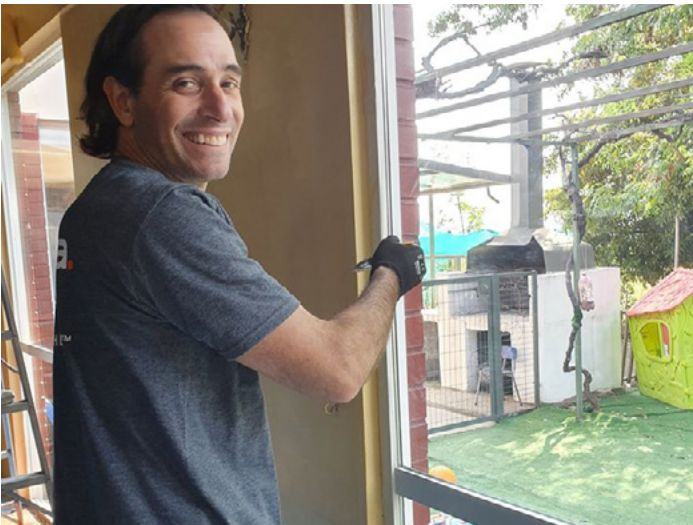
Chile team volunteering with Hogar Esperanza Foundation.