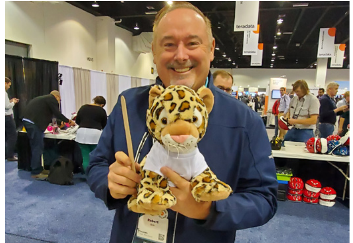
Teradata Universe Conference, Teradata Cares Activity.

variety of activities to give back to children and support animal welfare. They built bikes and assembled STEM planters for classrooms. They built dog houses, put together animal care kits and created dog blankets and toys. Our customers tell us year after year that it's a pleasure to take some time and give back while attending the conference.