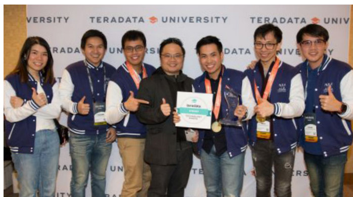
Teradata Technology Award Winner – NIDA Business School, Thailand.