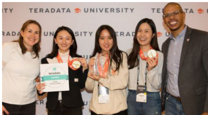
Overall Winner – Washington University St. Louis, USA.