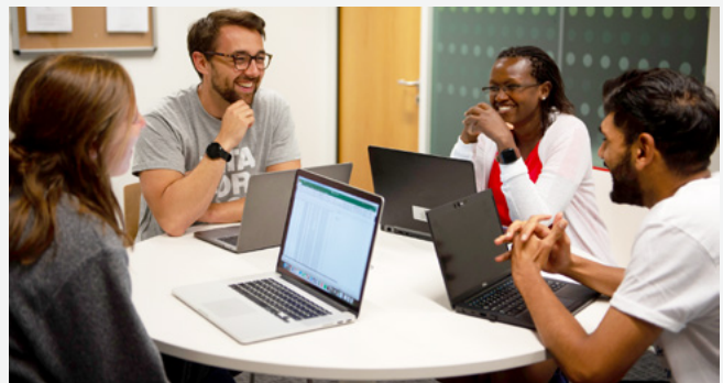
Elsevier Foundation and Teradata, DataKind DataDive, London, July 2019.

In July, we co-sponsored a DataDive in London with Elsevier Foundation. Read all about the important data projects here.