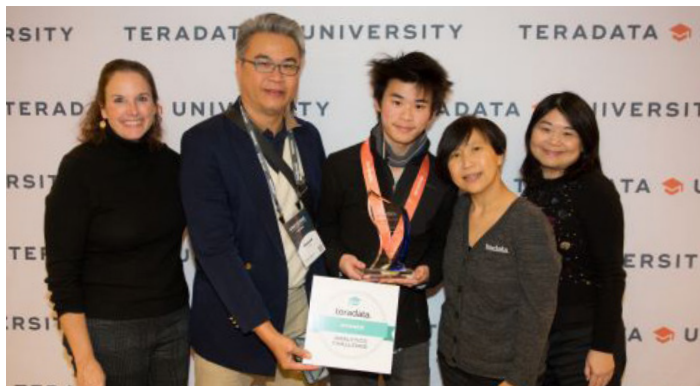
Overall Winner – Lawrenceville School (high school), USA.