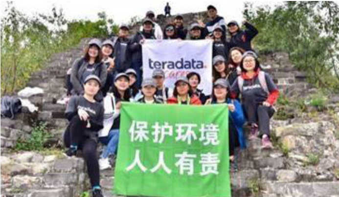
Beijing employees picking up discarded rubbish at the Great Wall.