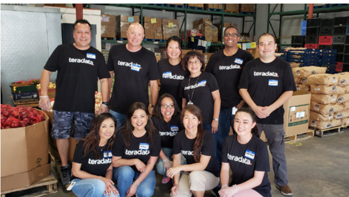
San Diego gives back at the North County Food Bank.