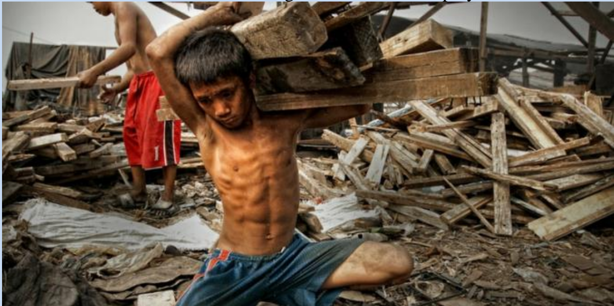
employee relationship especially with the labour

IMAECSED plays a pivotal role to restrain illegal child labour and their working conditions. We are some cases reporting the matter to the court Or other legal authority and other competent authority concern. We are committed to the UNGC to restore highest standard of employer and .