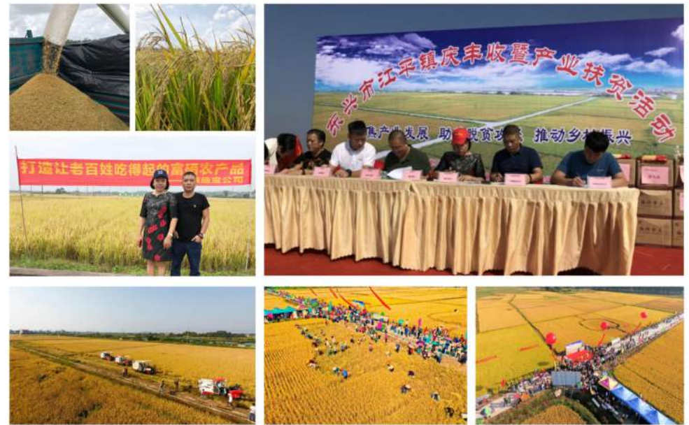
7月23日 中新网报道喷施宝公司助力东兴530亩连片荒地变丰收生态富硒良田。 23 July Chinanews reported that Penshibao Company helped Dongxing's 530 mu of barren land become an ecological selenium-rich land with good harvest.