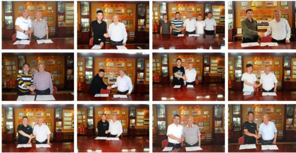
4月3日 喷施宝公司推行合伙人经营模式受到全国各地合作伙伴欢迎。 3 April Penshibao Company's implementation of the partner business model was welcomed by partners across the country.