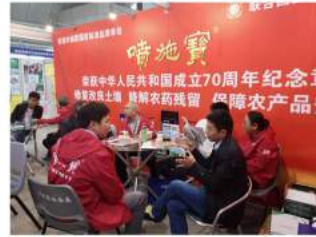
11月22日 喷施宝组团参加第35届中国植保双交会。 22 November Penshibao organized a delegation to participate in the 35th China Plant Protection Information Exchange & Pesticide and Sprayer Facilities Fair.