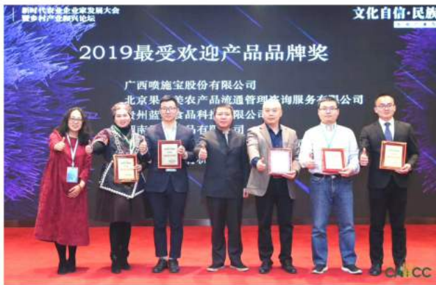
12月7日 喷施宝荣获2019最受欢迎产品品牌奖。 7 December Penshibao won the 2019 Most Popular Product Brand Award