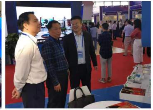
12月19日 喷施宝被授予广西发明创造成果金奖。 19 December Penshibao was awarded the Guangxi Invention and Innovation Achievement Gold Award.