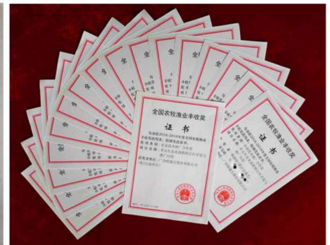
12月22日 喷施宝“多元生态水溶肥料合作开发与推广应用”项目，获得全国农牧渔业丰收奖一等奖。 22 December Penshibao's "Cooperative Development, Promotion and Application of Multiple Ecological Water Soluble Fertilizer" project has won the first prize of the National Agricultural, Animal Husbandry and Fishery Harvest Award.