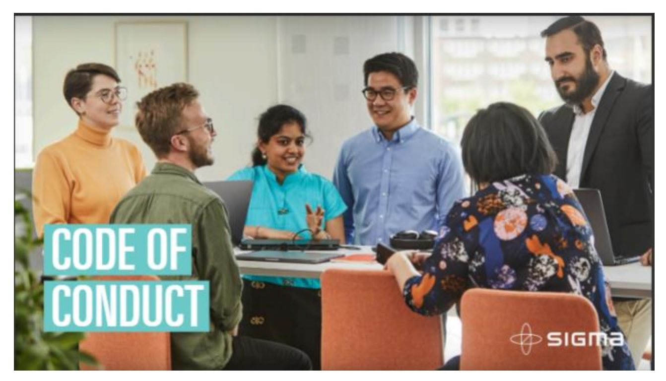
The Code of Conduct is available internally on the intranet and externally on our website www.sigmait.se