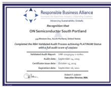
South Portland, ME, USA Platinum

Our corporate social responsibility and environmental sustainability programs have oversight of the ON Semiconductor Board of Directors Governance and Nominating Committees. Each quarter, they review the status of our progress towards our annual goals. Ten (10) of our internal manufacturing sites received RBA Validated Audit program (VAP) award recognition for their commitment to the RBA Code of Conduct. Examples are below: