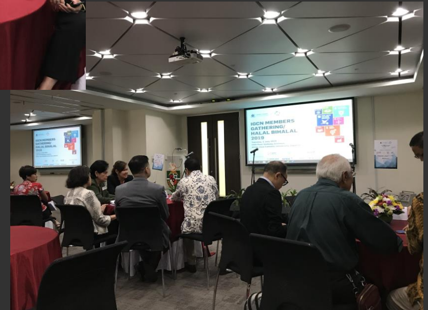
Participating on IGCN Member Gathering Halal Bihalal 2019