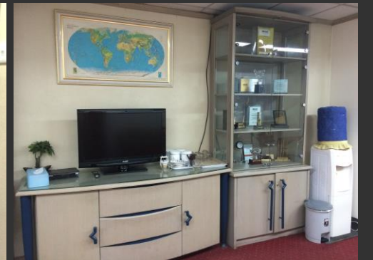
ExecuTrain's refreshment area