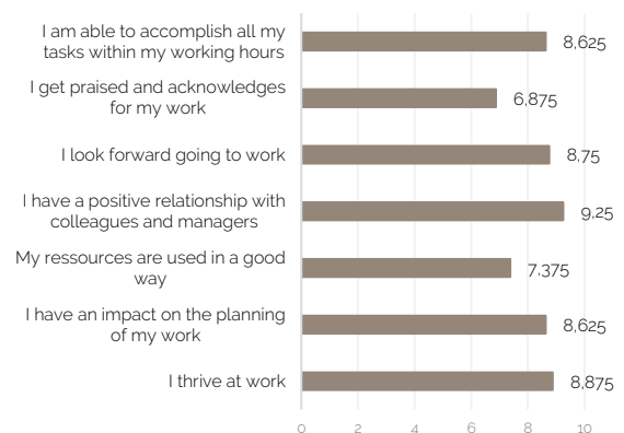
Employee satisfaction survey in average