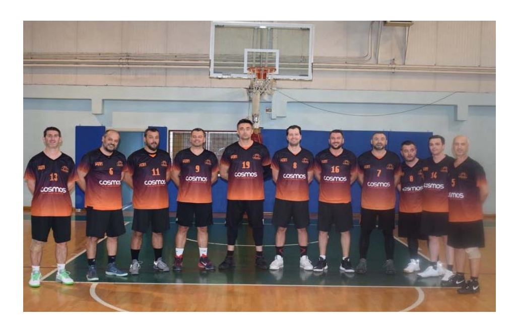
Principle 3: Businesses should uphold the freedom of association and the effective recognition of the right to collective bargaining protection of internationally proclaimed human rights

Principle 4: The elimination of all forms of forced and compulsory labour;