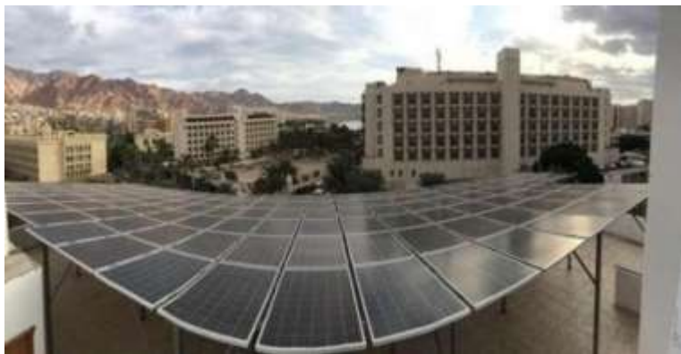
Solar Panels – NG Aqaba Building

In 2016 started to install solar panels in our offices at Aqaba, and in 2017 the solar panels went operational, covering approximately 75% of the electrical needs on our Aqaba building, and today, and in 2018 it's covering 100%.