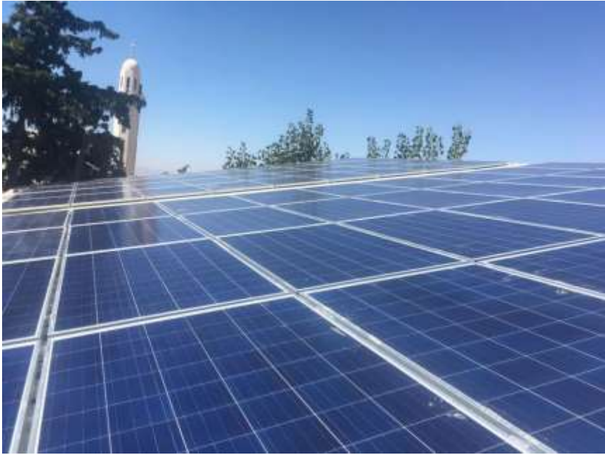
Solar Panels NG – HQ – Amman

And in continuation of our environmental policies, we have implemented solar panels on our HQ offices in Amman and at our inland container terminal at airport road. Our energy saving in both sites is expected to reach more than 100%.