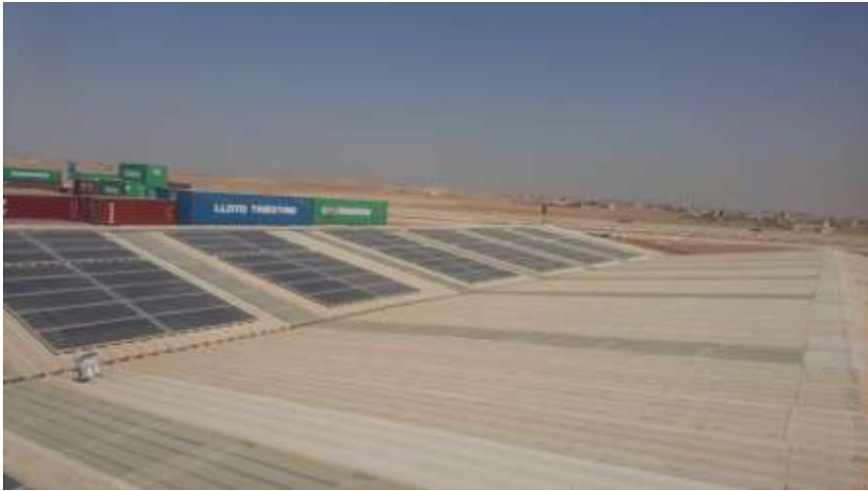
Inland Container -Terminal Airport Road