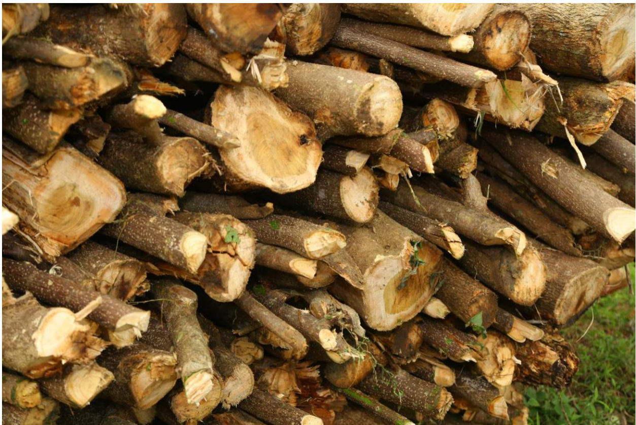
Picture 5- Gliricidia branches is neatly stacked waiting for collection – the harvest from one small holder