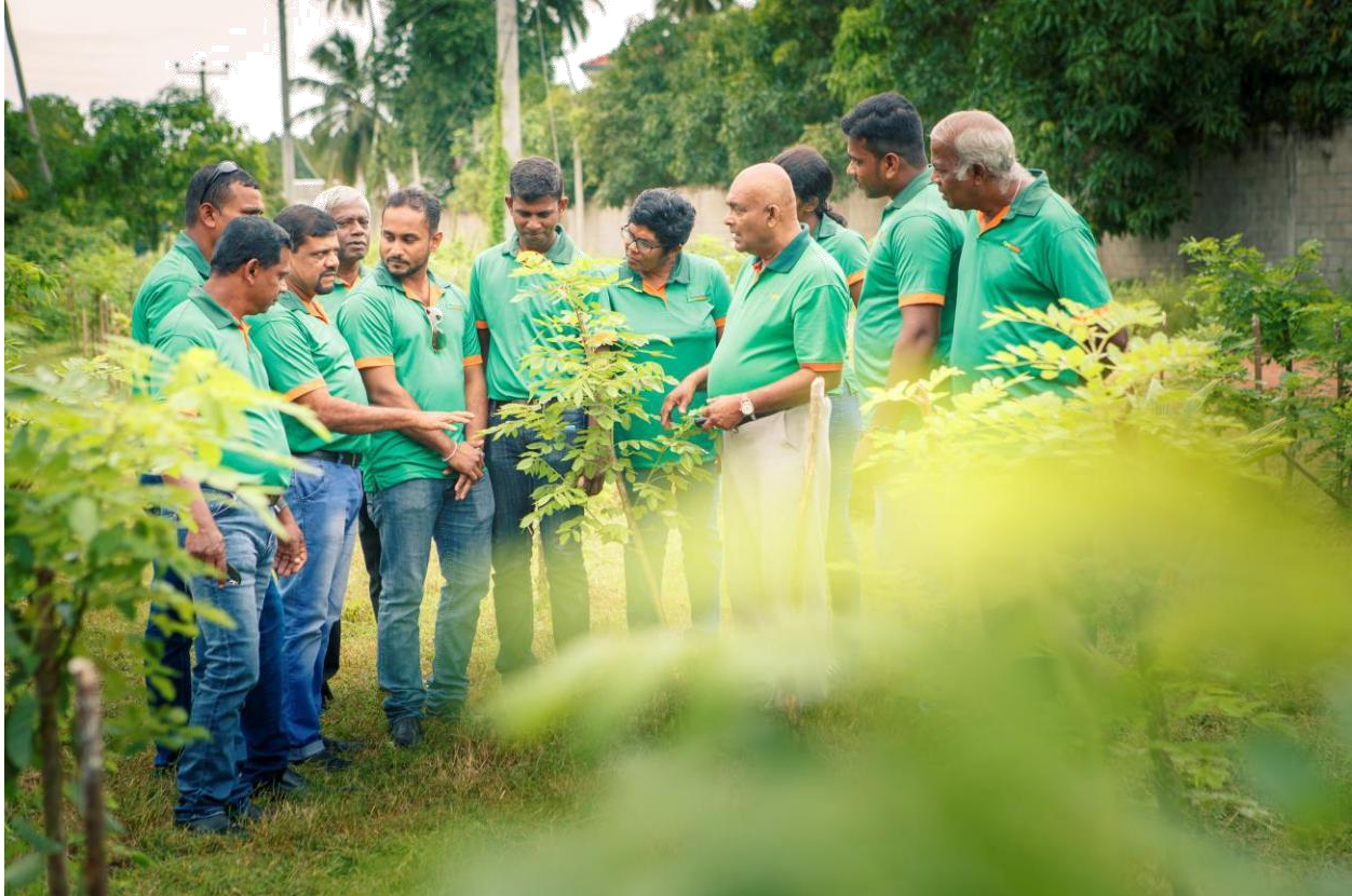
Picture 3- Field Officers are trained well by experts as they are the face of the Company at ground level.

Farmers shall freely decide without any manipulation or coercion on their participation in the project activities (including trainings). Field Officers seek prior consent of farmers by endorsing the data uploaded on the registration form and by signing the Agreement before starting any activity. In addition, PLAN T IT Platform through which the farmer registration is done has a Data Consent Agreement attached with the registration through which the farmer gives his/her consent to participate in the program. Farmers' decision to participate is based on the information provided by the Field Officers (about the company and its activities) and the terms of the Agreements. Also Biomass Supplies (Pvt) Ltd ensures that farmers fully understand the Agreement by translating it into local languages (Sinhala and Tamil).