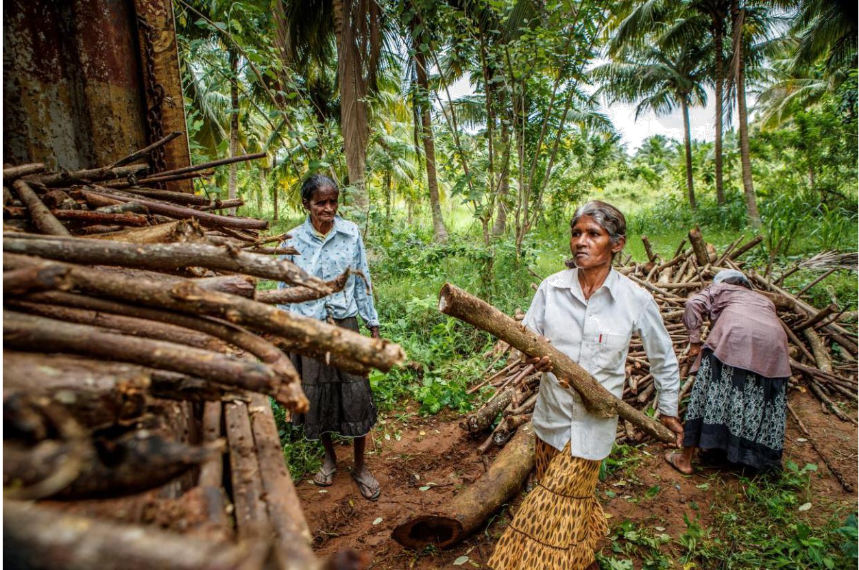
Picture 2- Women Participation is about 90%. Here they load Gliricidia fuel wood into a truck.

Our focus on home gardens makes it easy for women to join with the business as gardening is a ‘women work’ which is often considered economically unproductive. By doing so the company adds an economic value to the usual work women engage at household level. Company has a policy to conduct money transactions through bank accounts, thus giving rural women an opportunity to have bank accounts followed by savings and eligibility to access credits. By participating in the out-grower model they are better organized to help each other in planting, harvesting and collecting Gliricidia.