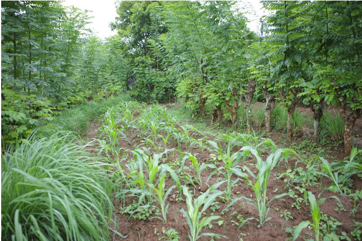
Picture 4- Gliricidia trees are either planted as a 'live fence' or intercropped with other crops

lead to automatic termination of the contract between the farmers and the company. This is monitored through frequent farmer visits by Field Officers and random farmer visits by Regional Managers.