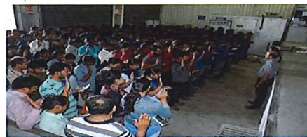
AQ employees in India take an oath to comply with AQ Group Core Values

In addition to this AQ is supporting a village in India through the Hand in Hand foundation. We donate money to prospective entrepreneurs in the village to help them to a better life.