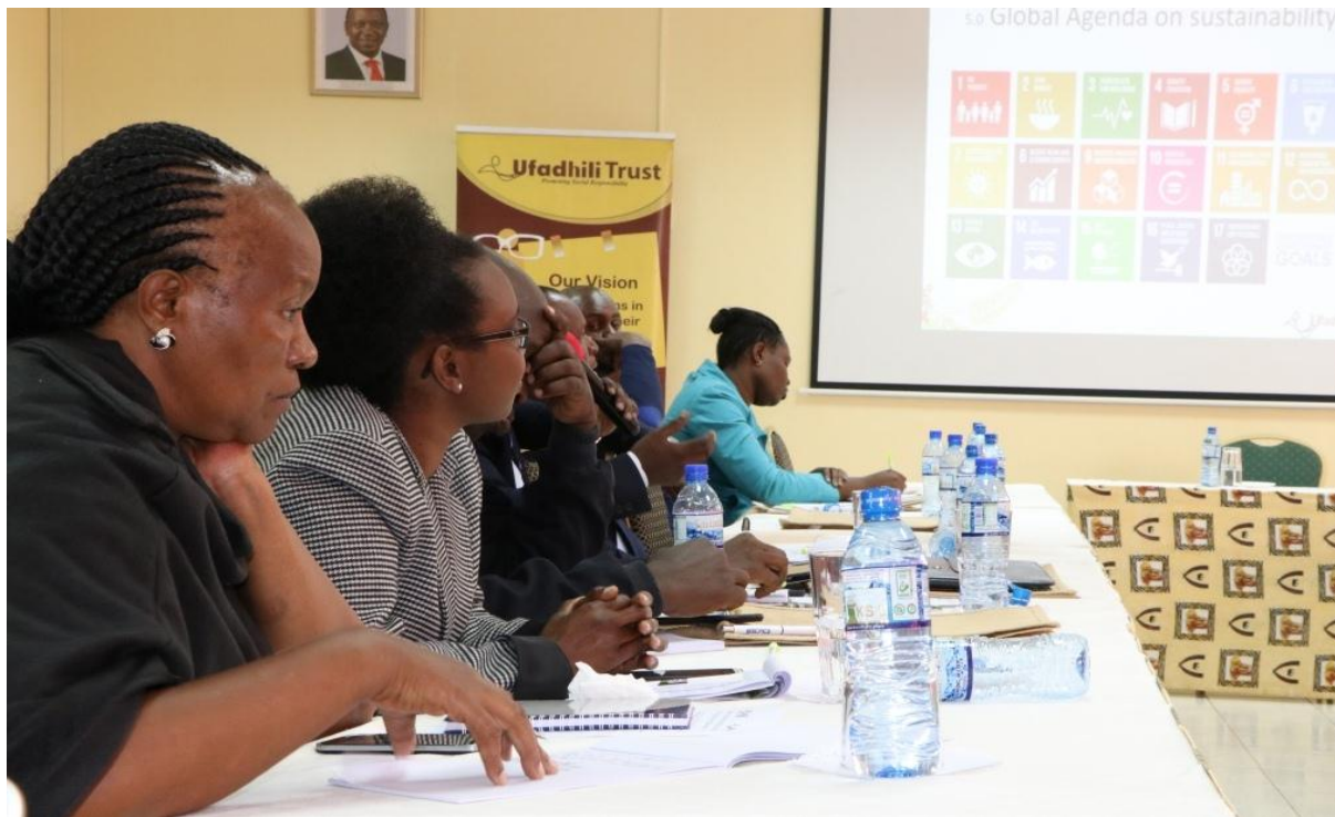
December 2019: Training on Sustainability for public entities in Kenya.

Ufadhili Trust and Kenya's Public Sector Accounting Standards Board (PSASB), trained state corporations and county governments on sustainability; social and environmental accountability/reporting – in December, 2019. The training aimed at providing the public officers with a deeper understanding about sustainability that includes social and environmental matters, with a view to improving accountability within the public sector in Kenya. Since 2015, PSASB has been part of the promoters/organizers of the Financial Reporting (FIRE) Awards, alongside the Institute of Certified Public Accountants of Kenya (ICPAK), Kenya's Capital Markets Authority (CMA) and Nairobi Securities Exchange (NSE).