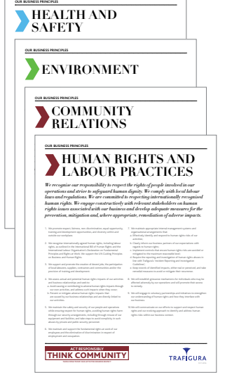
Our HSEC Business Principles www.trafigura.com/brochure/ trafigura-hsec-business-principles