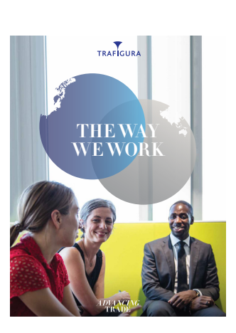
The Way we Work www.trafigura.com/careers/theway-we-work/