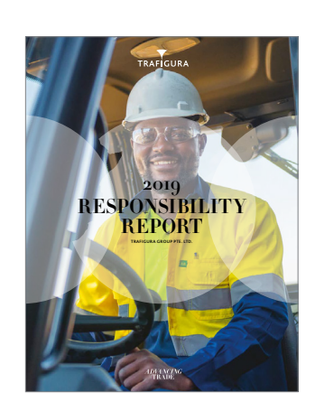
2019 Responsibility Report www.trafigura.com/ brochure/2019-trafiguraresponsibility-report