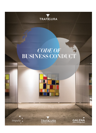
Code of Business Conduct www.trafigura.com/brochure/ trafigura-code-of-businessconduct