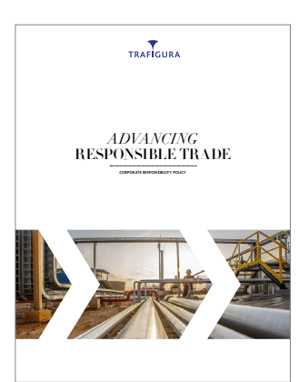
Corporate Responsibility Policy www.trafigura.com/brochure/trafigura-corporate-responsibility-policy