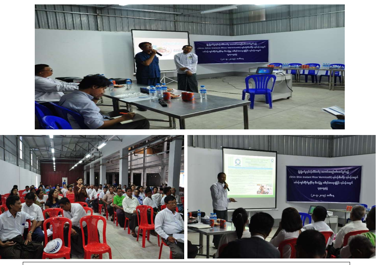
Public Meeting on Environmental Management Reporting

The purpose of this meeting is to conduct public meetings aimed at the development of environmental impact and sustainable development in accordance with environmental Management practices in the Cho Cho Industry Limited.