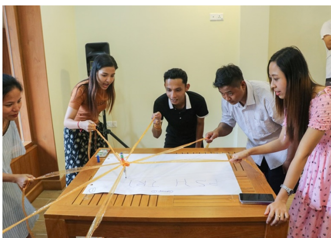
Fig: PSH Team Building Activities