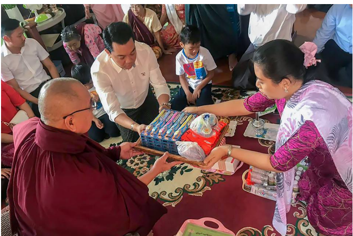
Fig: PSH's Annual Donation (CSR) Program at Senior Citizen Care Center