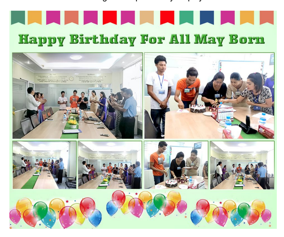
Monthly staff birthday party for employee