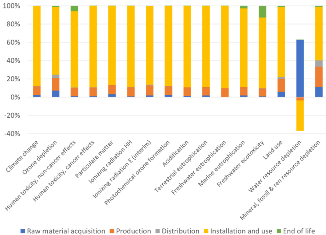
Environmental footprints of 1 m 2 needle punch bitumen backed tiles – ILCD method characterisation