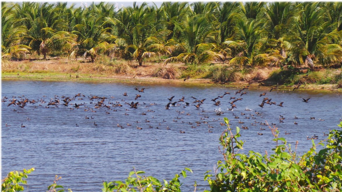
Protected areas are essential to the maintenance of local ecosystems. 20% of all our land has been carefully selected to be left untouched to create refuge for local flora and fauna