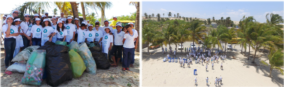
Through words and actions, our initiative is already permeating through the local community and demanding a broader scope