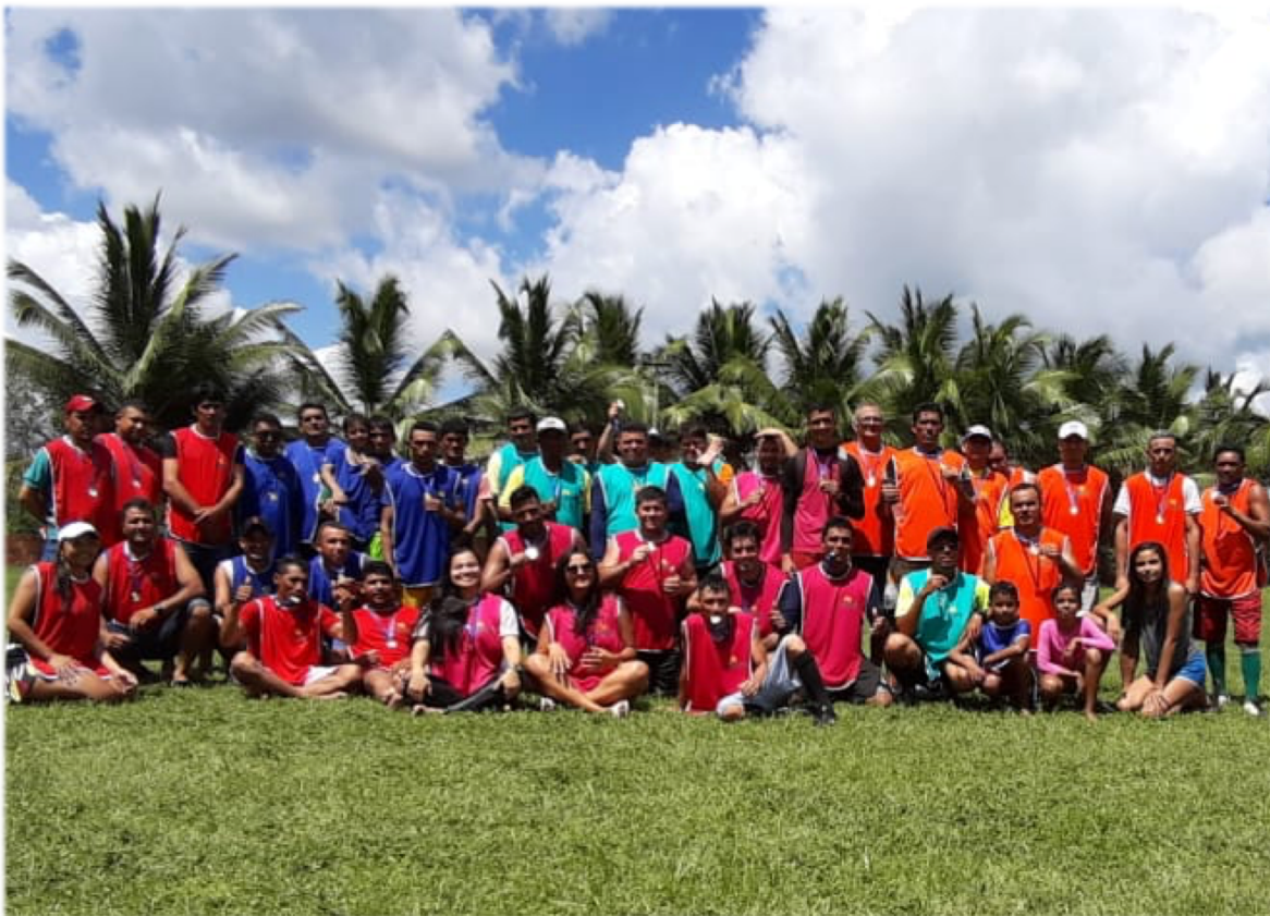
Our employees and their families had a great time at this year's soccer game