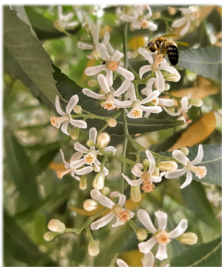
Bees thrive with neem

Neem offers a diverse range of applications across the agricultural sector. Natural and effective, it is an organic alternative for synthetic pesticides that is effective against over 600 species of pests. Biodegradable and non-toxic to mammals and beneficial pollinators, azadirachtin , disrupts the growth cycle of insects and deters them from feeding on plants.