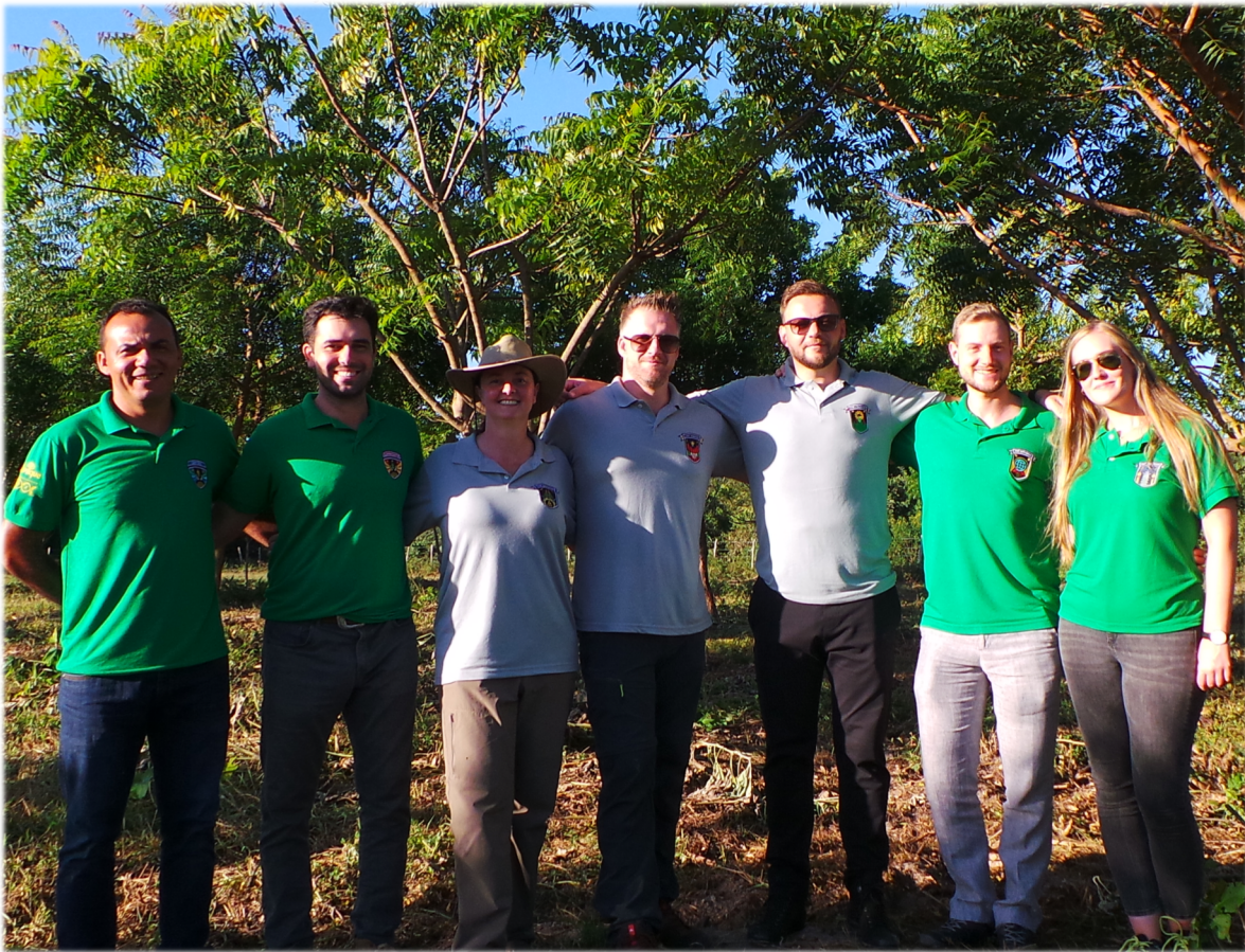
Our management team strives to ensure both the permanence of natural capital and globally competitive yields

assisted by the latest technology, we are ushering a new era for agriculture; one that guarantees higher yields by nurturing the soil and the surrounding ecosystems. Our agricultural project has been joined by our natural, neem-based beauty and personal care brand, ViTA. Using the world's first and currently only 100% OceanBound recycled bottles, made from plastic found in high-risk coastal areas where plastic waste is most likely to pollute the ocean, ViTA is playing a lead role in keeping the oceans plastic-free. At the intersection of sustainability and technology, we are constantly on the lookout for new business models that can satisfy the most fundamental requirements for life and secure a safe and prosperous future for us all - be it in the agriculture or the beauty industry, we believe the only way forward is through social and environmental responsibility.