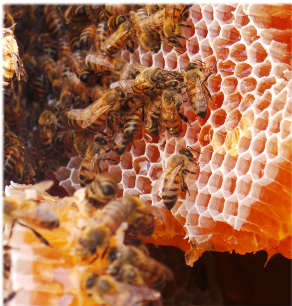
This season we harvested 1000 kgs of delicious honey

After a very productive rainy season, our bees have had more than enough flowers to feed on and create beautifully rich and delicious neem honey, which we have recently harvested. This season we were able to collect 1000 kg of honey, and we continue to be part of an alliance of 48 honey producers from all across Ceara.