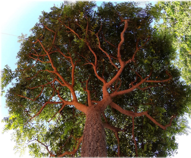
Adult neem tree

The neem tree ( Azadirachta Indica ) is a fast-growing species, which grows about 2.6 feet (80cm) every year and can reach up to 100 feet (30 meters) when fully grown. The scientific interest in the tree started in the 1950s, much of it centered on the oil from the fruit. One of its main active ingredients from the more than 250 compounds is azadirachtin , which has a complex chemical structure that provides much of neem's potency and unique anti-