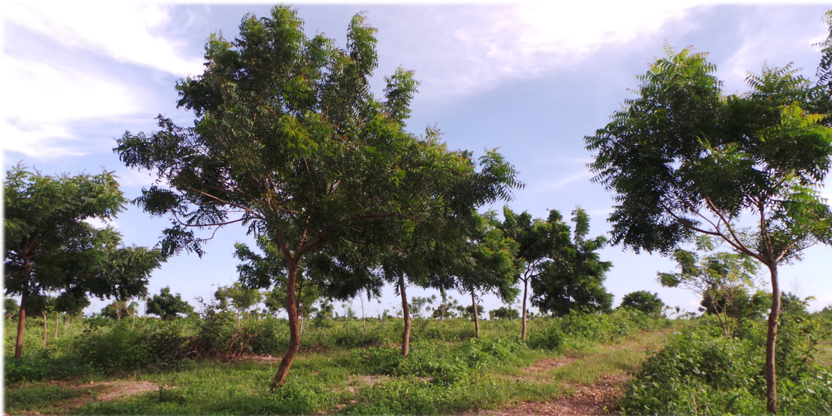
The neem tree offers a viable solution to the global food crisis

For centuries, the neem tree has been known as “The Village Pharmacy” in India, providing hundreds of uses that have ranged from treating diseases to feeding cattle. Today, the tree is being studied for its multiple uses and applications across agriculture, beauty and personal care, healthcare, and environmental protection. The neem tree truly is an agro-scientific celebrity and it is not without reason that it has been declared the “Tree of the 21st Century” by the United Nations.