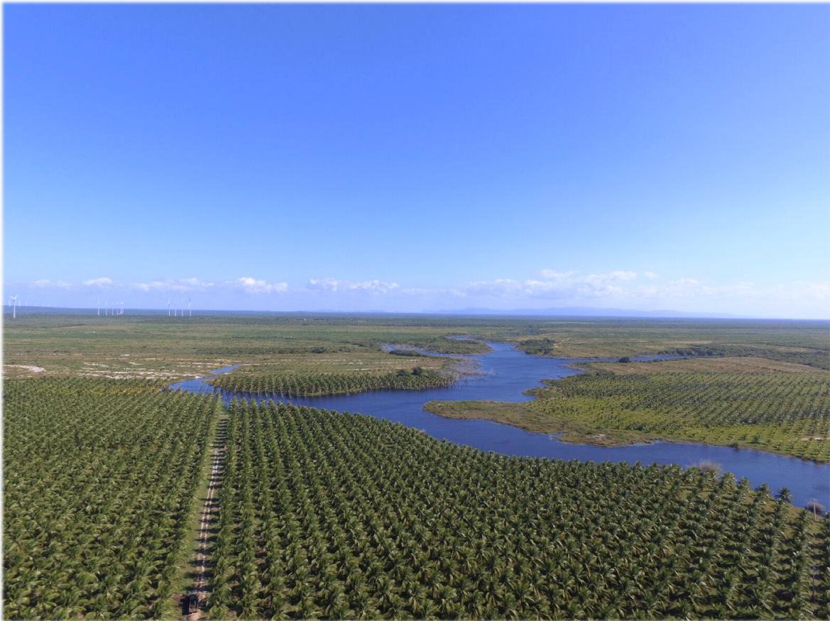
Our project aims to build an entirely new agricultural system based on safe, innovative and regenerative best practices

The archaic system of the current industry needs to be transformed into one that guarantees the needs of all are met in a safe and sustainable way. At Primal, we believe the neem tree, as a crop care solution that delivers effective protection and high yields without harming the environment or human health, has the power to transform the future of agriculture and food production. This unique resource offers natural and innovative solutions where they are needed the most – across agriculture, healthcare, and environmental protection.