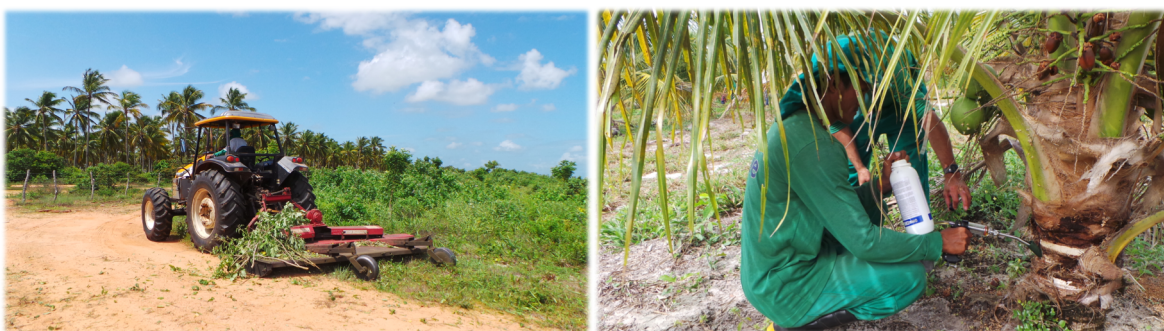
Brushcutting (left) and precision crop care (right) help us nurture our plantation naturally without harming the environment