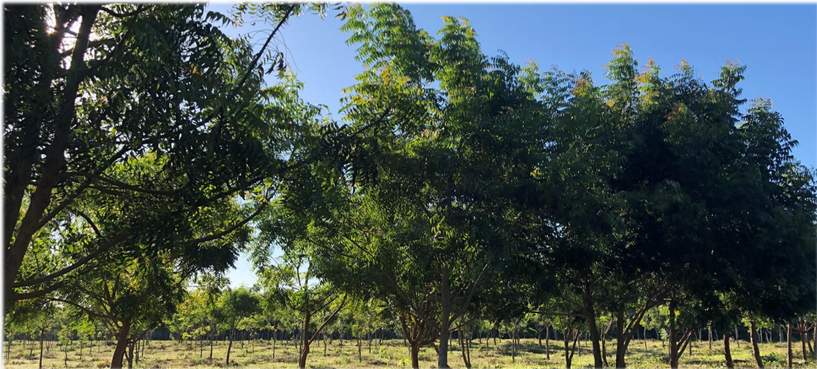
Our project aims to build an entirely new agricultural system based on safe, innovative and regenerative best practices

In the age of climate change, planting more trees worldwide is a practical way to cleanse our environment through long-term carbon entrapment. For those examining the benefits of planting trees, neem trees tick many of the boxes for its suitability. A hardy, drought resistant tree, with a thick foliage, very high leaf surface area and wide canopy, neem has the capability to provide a shield against other pollution components, with a sequestration capacity of 12.27 tons