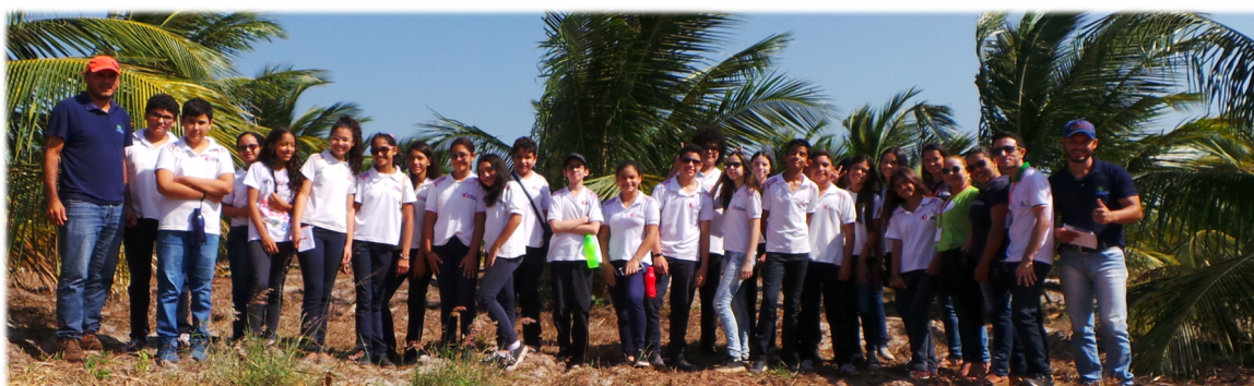
Local school children visit our plantation to learn about sustainable agriculture