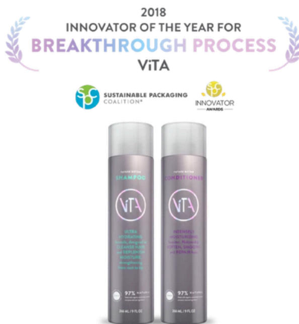
Every ViTA bottle sold prevents a bottle of the same size from floating in the ocean

On a global scale, we are tackling plastic waste by revolutionizing the beauty and personal care industry through our brand ViTA and its sustainably driven packaging. ViTA's bottles are the world's first and currently only bottles to be made entirely from 100% OceanBound recycled plastic. OceanBound plastic, sourced through our packaging partners Envision Plastics, is defined as plastic found in high-risk coastal areas where there is no formal collection system and plastic waste is most likely to enter and pollute the ocean. With each ViTA bottle sold we are preventing a plastic bottle of the same size from floating in the ocean. ViTA insists upon non-toxic ink and labels that separate from ViTA packaging so that they enter the recycling stream of mainstream recycling facilities, without the need for rarely available technology, which can lead to recyclable bottles ending up in landfills due to inseparable labels.