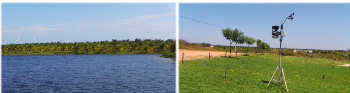
Our eco-dam (left) is an essential resource for sustaining our crops throughout the year. Agrosmart (right) allows us to optimize irrigation and reduce the environmental impact of misusing water

Through the continued implementation of the latest agricultural technologies, we now also have the capability to monitor specific hydrational needs around the farm after the installation of a network of underground sensors. The key use of this technology is to increase irrigational efficiencies. By monitoring the relative hydration levels with Agrosmart, we can directly target dry areas with strategic watering.