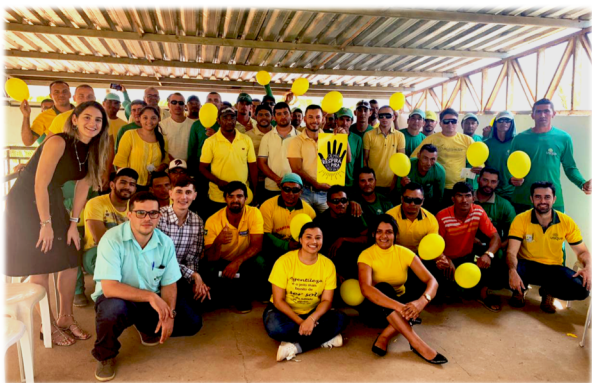
Depression and Suicide Prevention event

As part of our commitment towards the safety and future of our employees, we carry out monthly meetings with our Internal Commission for Accident Prevention (CIPA). This committee consists of three representatives elected by our employees, as well as three representatives elected by the company. During these meetings, which are supervised by a third party, we address topics