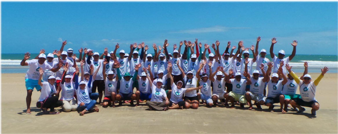
Many people participated in this year's beach clean-up. The day included a lunch provided by our company for everybody involved in the clean-up efforts

Over the course of this year we were able to collect a total of 10,707 polyethylene bottles.