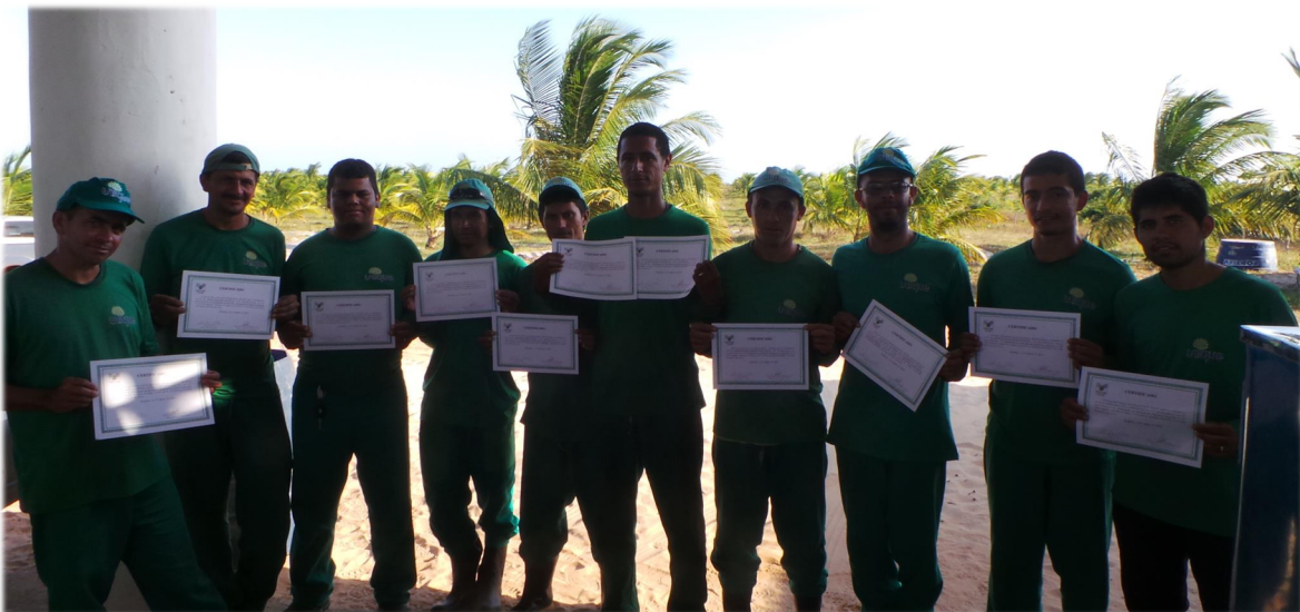
We want our employees to know that they are part of the new Green Revolution and that their work is crucial towards the success of our project