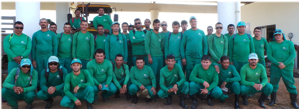
We constantly strive to go beyond the traditional company-employee relationship and inspire our employees to help us disrupt current business models

Our corporate values and the ten UN Global Compact principles set out the framework for our business conduct and our sustainability efforts. Over the course of this year we have made significant progress in fulfilling our Sustainable Development targets, as we continue to revolutionize the agricultural industry and business world.