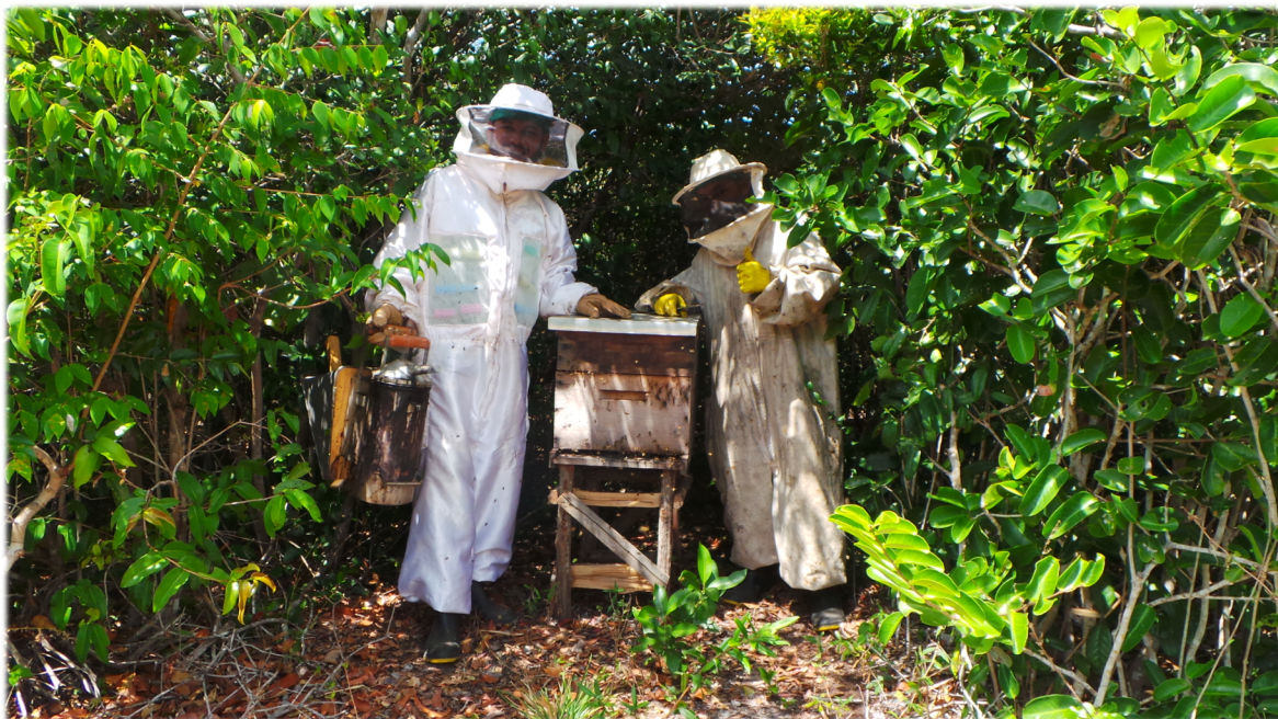
Originally implemented to study neem's effects on bees, our on-site bee colonies have proven that neem pesticides and fertilizers function in harmony with beneficial pollinators such as bees

This is further proof of how neem and neem-based products are harmless to pollinators and are essential for the success of our project.