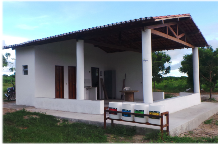
Employees can rest and recover at our new support point