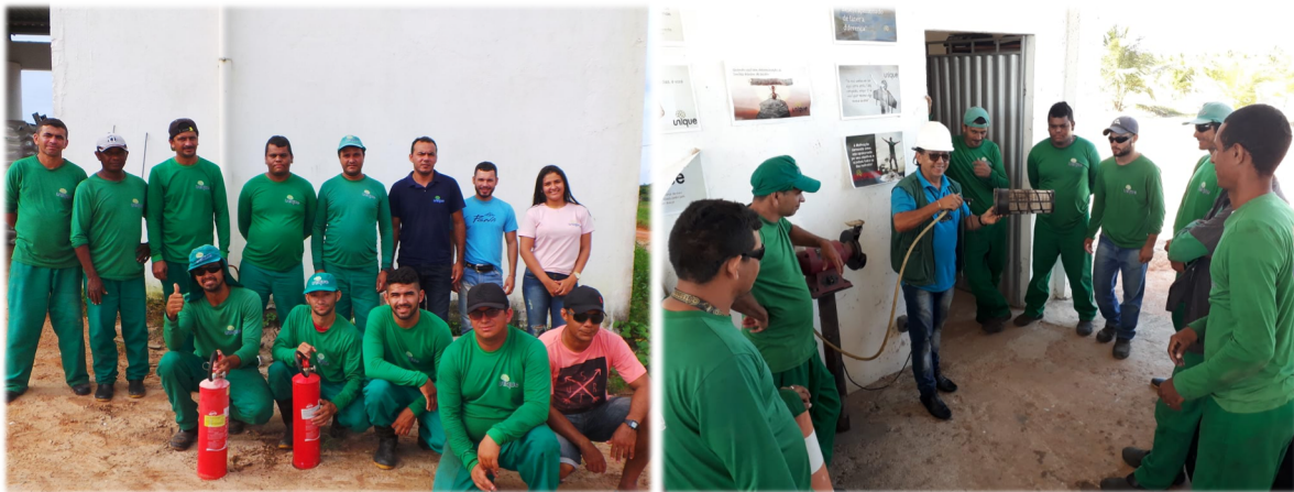
Regular trainings keep our employees safe and help them develop knowledge to best perform their duties and improve their skills beyond their job