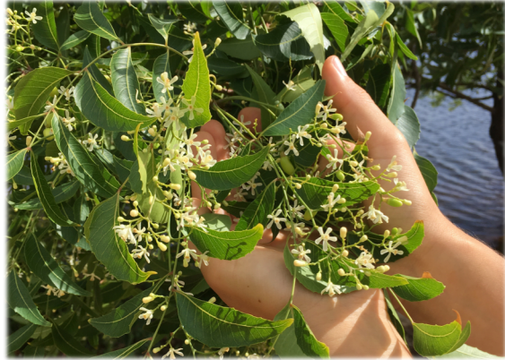
Neem is a solution to a variety of ailments

With over 200 compounds proven to be effective against cancer, malaria, diabetes, inflammation, infection, fever, influenza, skin disease and dental illness, neem is a solution to a variety of ailments. Over the past twenty years, major institutions have published several thousand papers exploring the plant's effectiveness as a natural medicine.