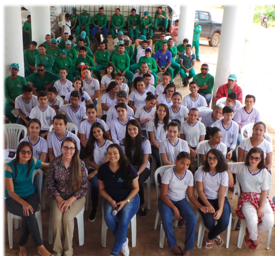
Fundamental human rights are a critical part of our Primal philosophy