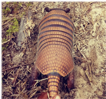
We were delighted to spot an armadillo on our plantation

Thanks to our wildlife protection policies, our plantation provides a shelter for a variety of different animals like armadillos, owls and snakes. Our environmental protection policies are at the very core of everything we do and aim to benefit the environment, the local community and our company, as well as create awareness of world's environmental problems and how sustainable practices can tackle them.