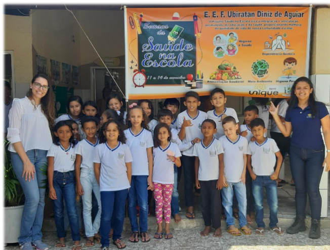
Over 250 children participated in this year's "Health Week" at the local Ubiratan School

Through our Sustainable Future Initiative (SFI) we regularly provide produce to local schools and education on sustainable farming methods. During this year's "Paraiso do Saber" event, we toured 45 kids from a local school