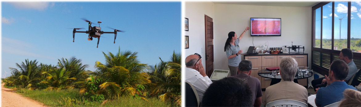
Drone technology and AG tech like Precision Mapper allow us to analyze various field metrics and reduce the use of organic inputs