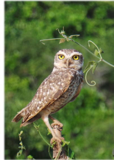
The burrowing owl is an endangered species

Additionally, the 40km/h speed limit on our plantation ensures small reptiles and birds are not run over.