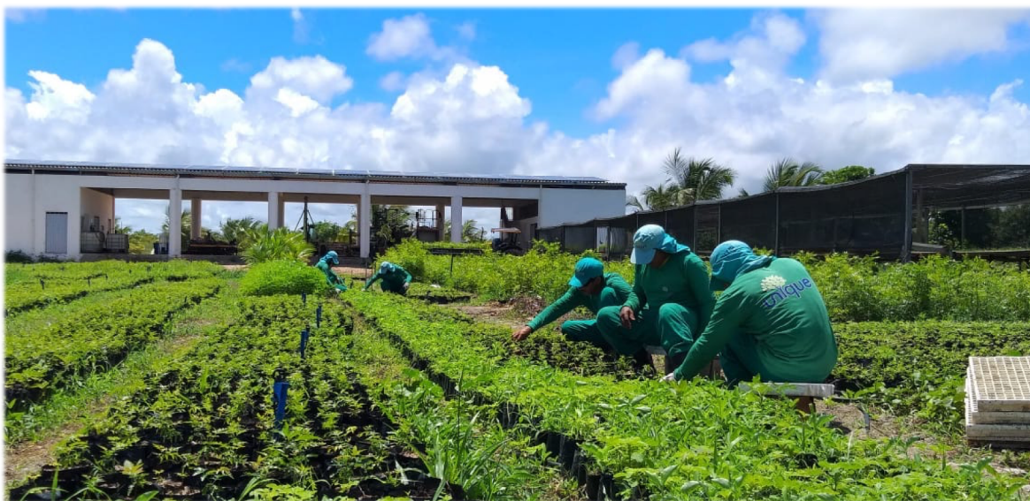
Workers nurturing neem saplings at our neem nursery