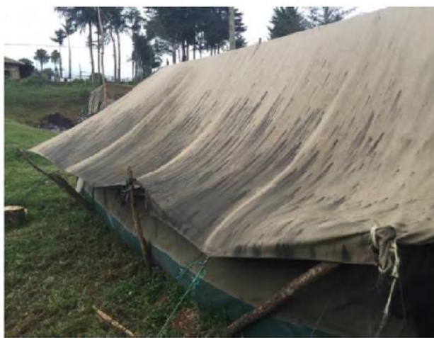
Old, rotting fly sheets for bedrooms.