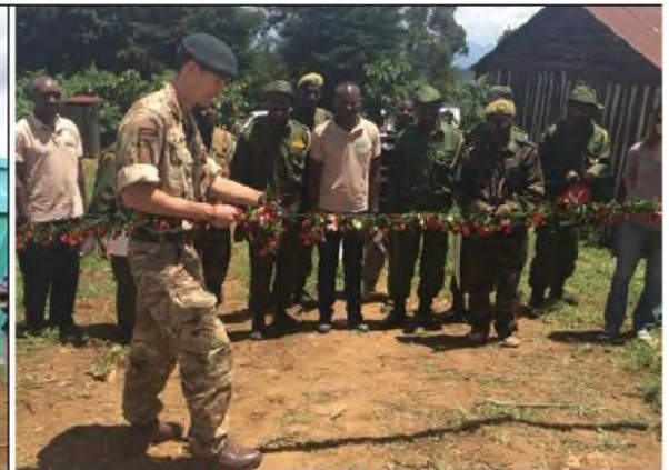
BATUK cutting the ribbon!