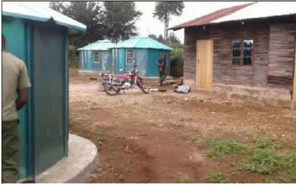
The new mess area and unipors