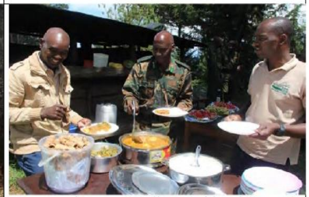
Enjoy some well-earned lunch!