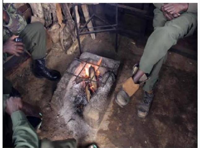
Stove in the kitchen.