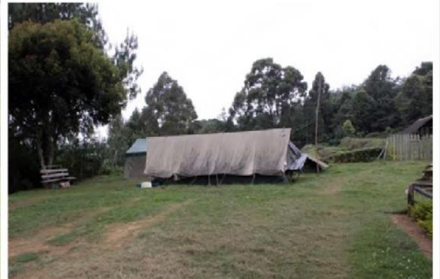
Fly sheets and living accommodation.