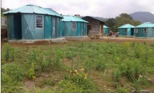
New accommodation blocks