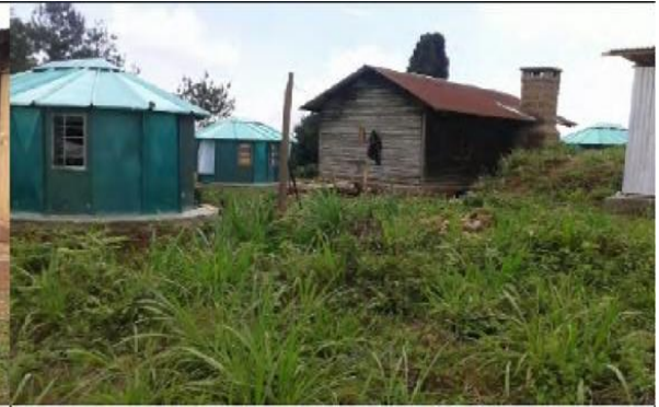
Unipors and mess area