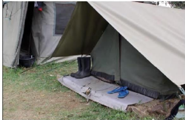
Front of tents.