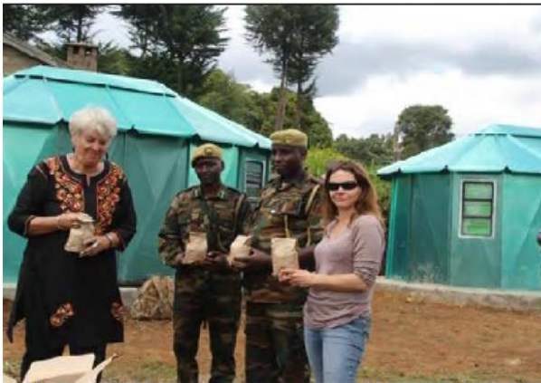
MKT Executive Director presenting Cookswell seedballs to KFS representatives.