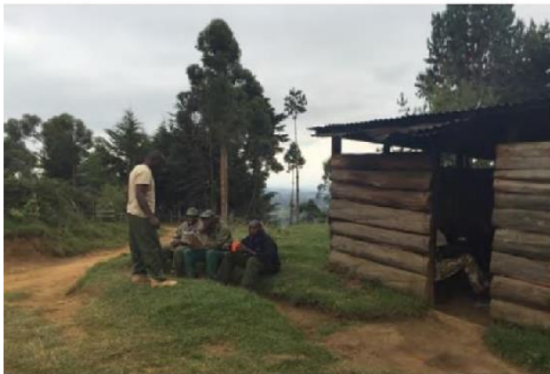
Eating area outside of the kitchen.