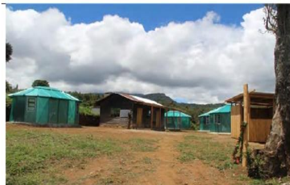
The kitchen area and mess area