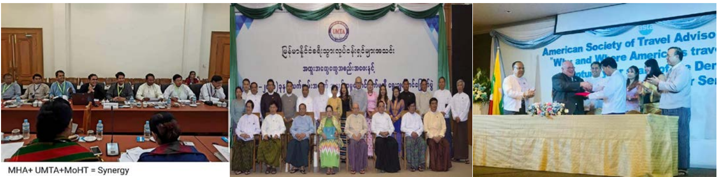
MHA+ UMTA+MoHT = Synergy

As a member of American Society of Travel Advisor, ASTA, one of the World Largest Travel Association and Union of Myanmar Travel Association, we always observe the guiding principle of Travel Associations especially not to complicit in Human rights abuse, gender inequality, and any discrimination.