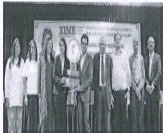
Winners of Debate Competition