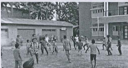
Spirited Children celebrating Children's Day