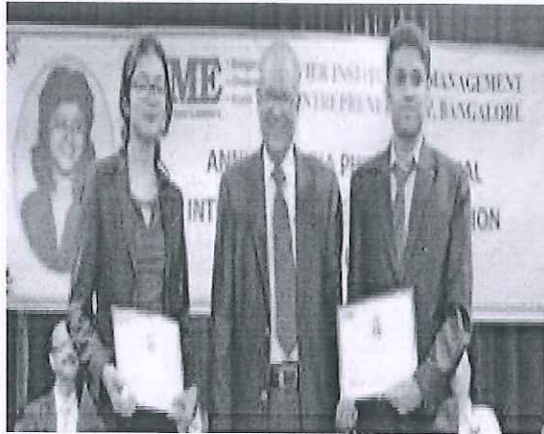
Runners up of debate competition