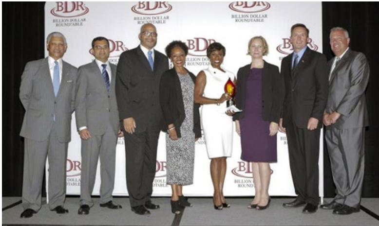
Cummins leaders join leaders from the Billion Dollar Roundtable (BDR) for the induction ceremony in 2016. BDR is a prestigious advocate for best practices in corporate supplier diversity.