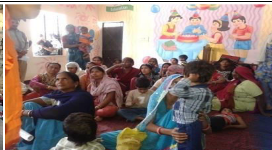
Health camp Children with their arts-crafts Awareness program session

Vocational training on Computer literacy on basic hardware, software and regular utilities of net facilities – a course of 3 months, 2 hours a day & 5days a week Allahabad, UP – total 50 beneficiaries. (Batch of 25 beneficiaries in 2 shifts).