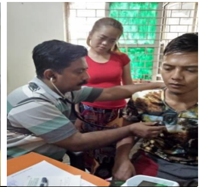
After group discussion