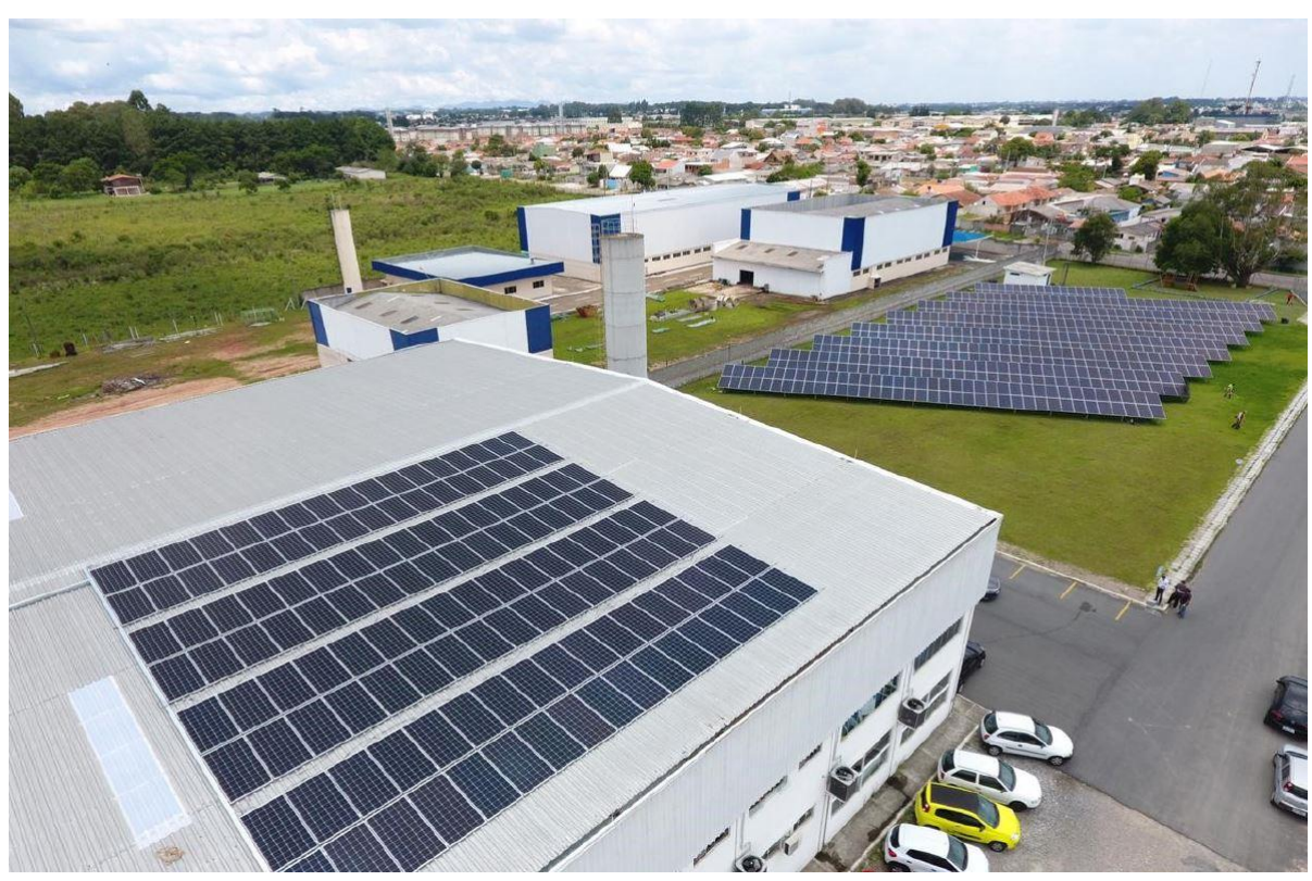
Table 1: Power plant at DIAM BRAZIL

In the beginning 2018, 180kWp of ground panels and then 50kWp additional panels on the roof have been installed on DIAM Brazil sites (see photo below). The powerplant produced 190 MWh of renewable energy in 2018 for the energy network and for the site's activities. At the beginning 2019, 38% of the DIAM Brazil electricity consumption come from this powerplant and saved 28 tons of CO2eq..